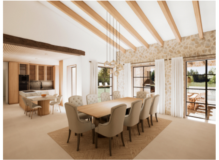
Elegant dining area