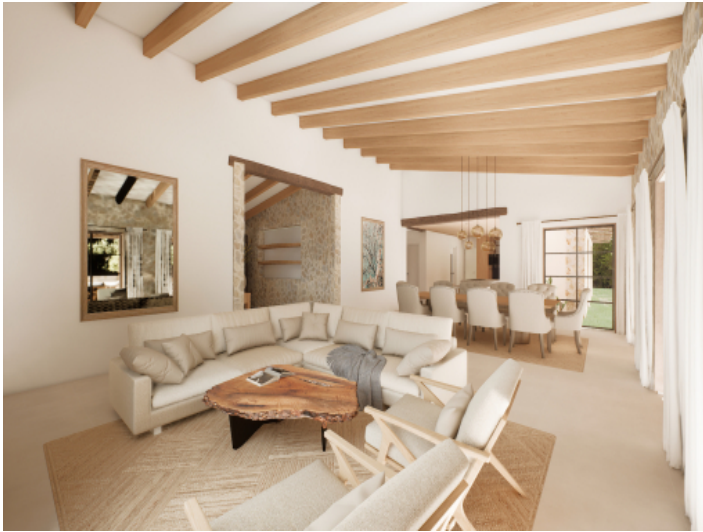
Open room layout