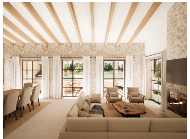
Bright living and dining area