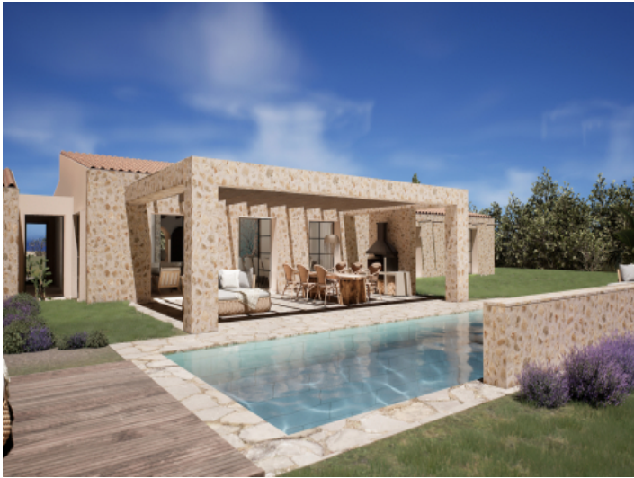
Fantastic pool area