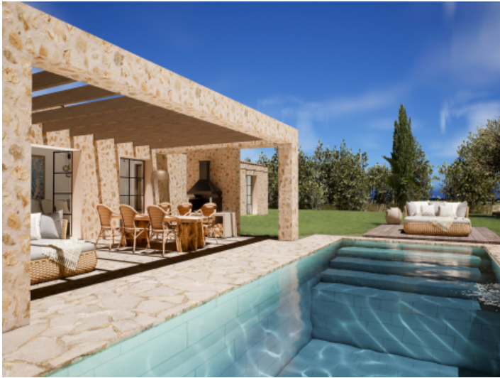
Large pool area