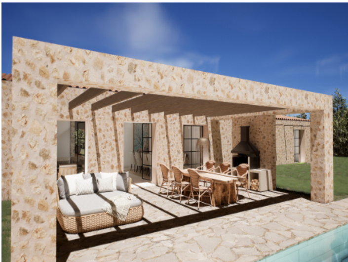
Terrace with BBQ area