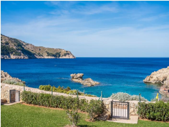
Direct access to the sea