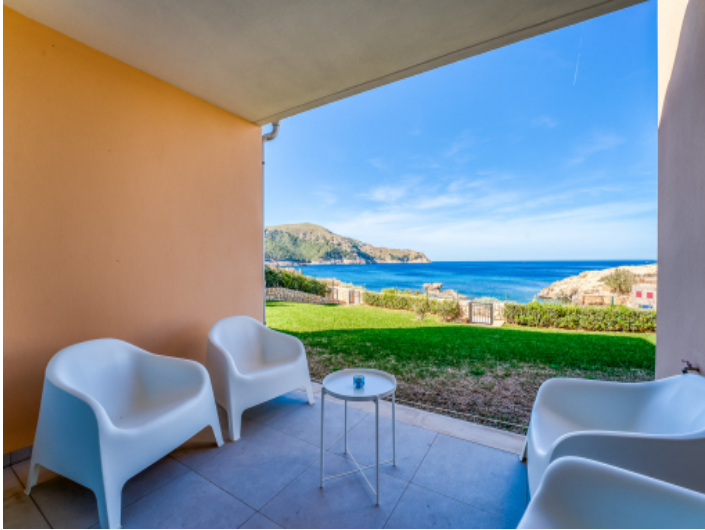
Terrace on the groundfloor