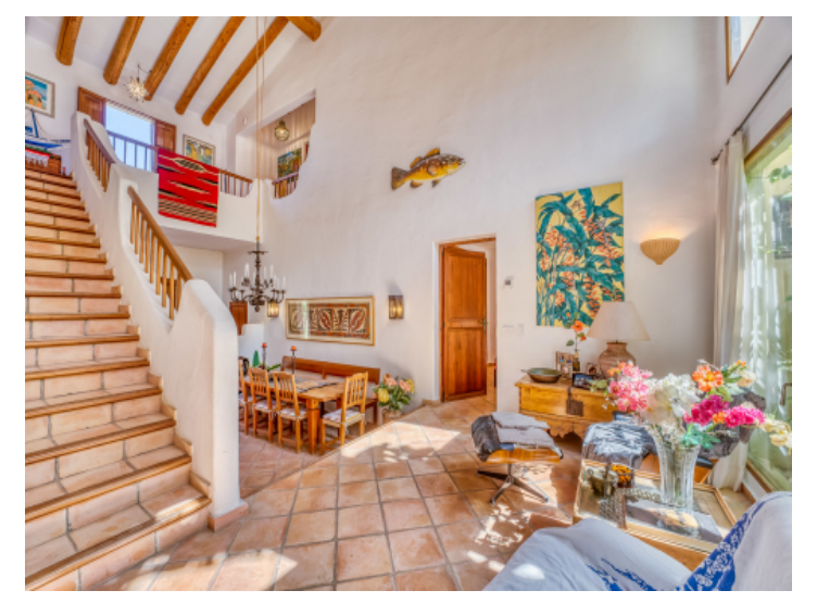
Staircase to the upper floor