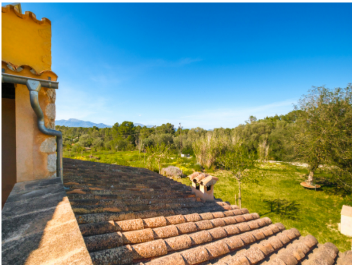
Views from the first floor