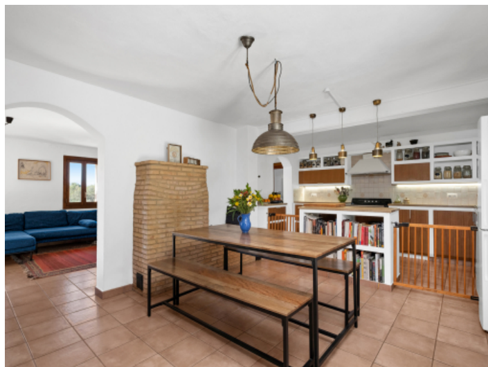
Dining area close to the kitchen