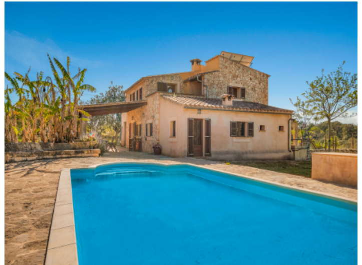
Views from the pool to the house