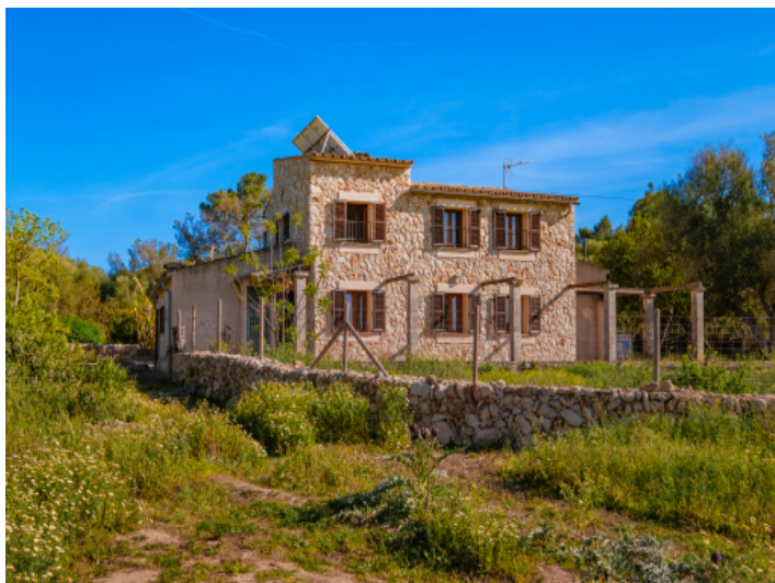
View from the garden to the house