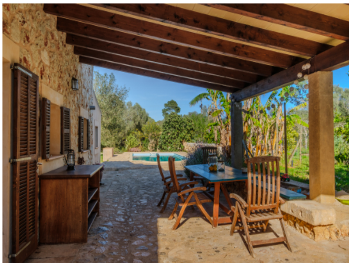
Large covered terrace