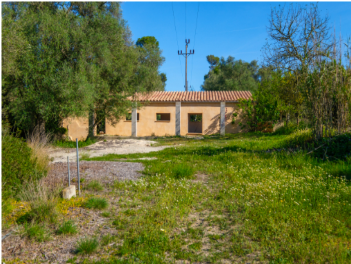
View to the anex building