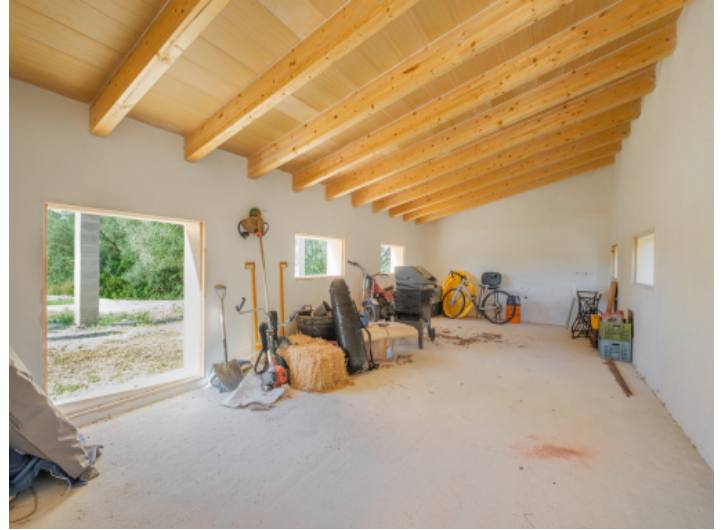
Anex building with lots of possibilities