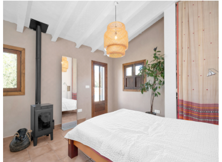
Bedroom with fireplace