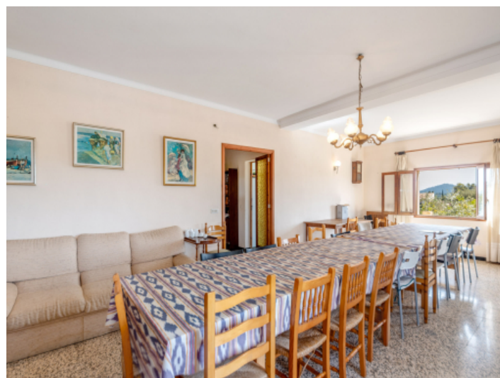
Living and dining area