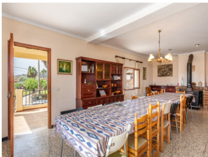
Living and dining area