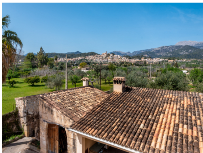
Views to the town