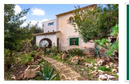
Cala Figuera search for property MAL-121308