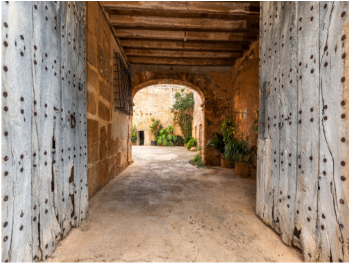
Entrance to the patio