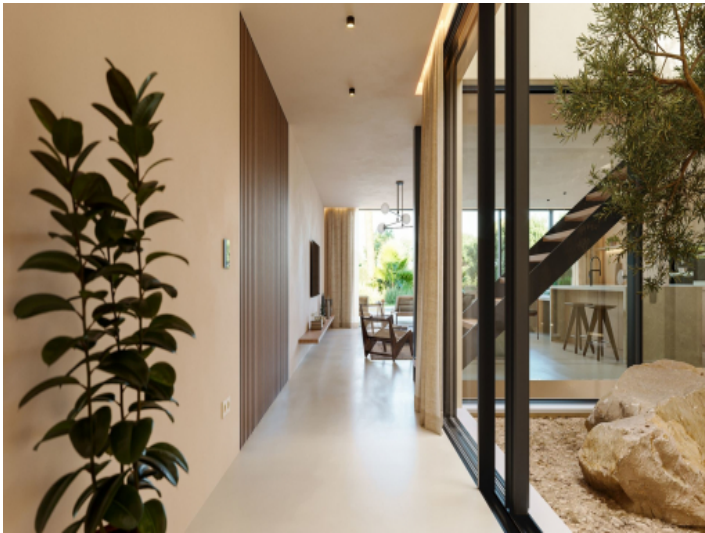
Light flooded modern villa