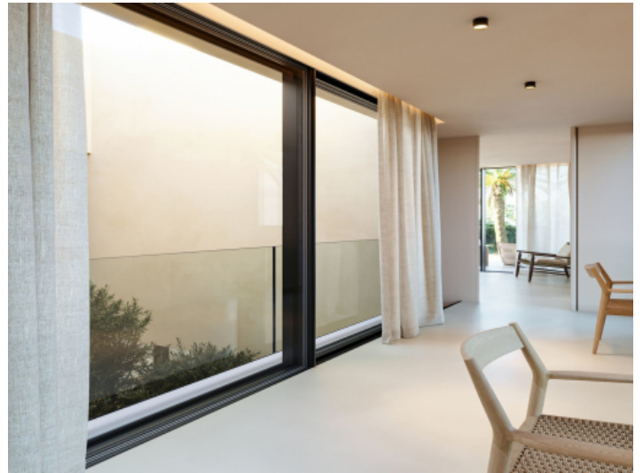
Large window fronts