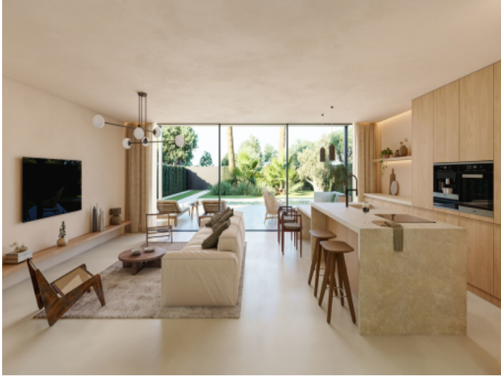
Open plan design