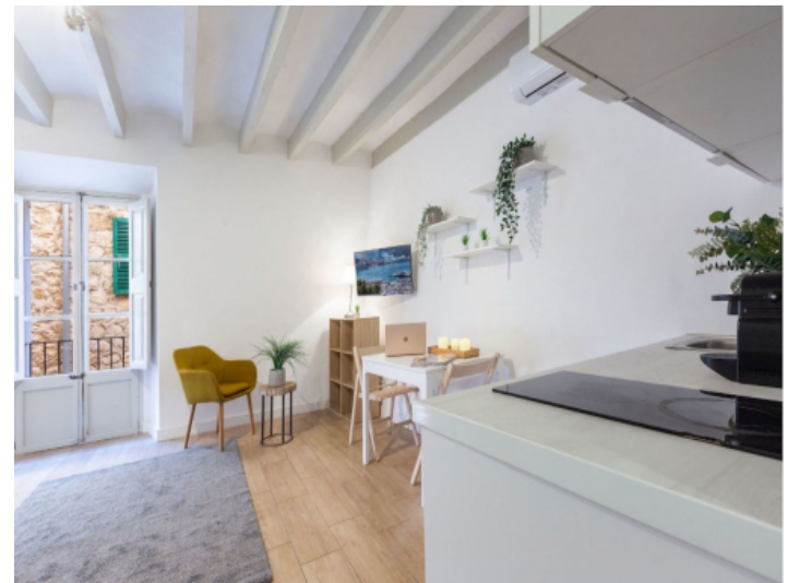
Renovated living area