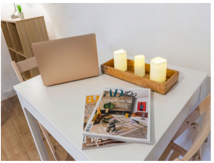
Small dining area