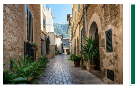
Soller search for property MAL-121209