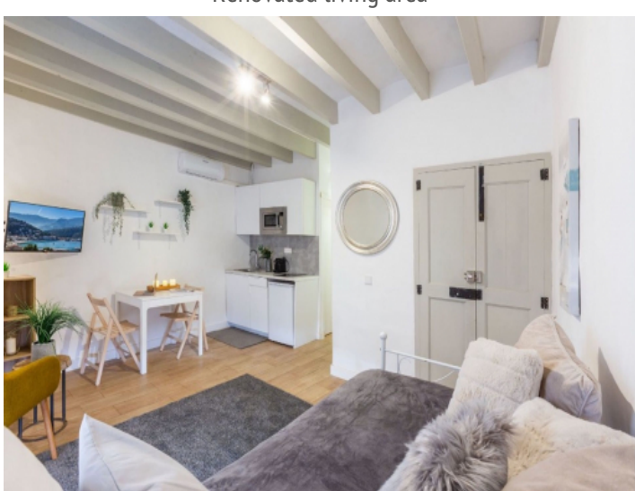
View to the entrance