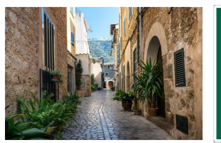
Soller search for property MAL-121209