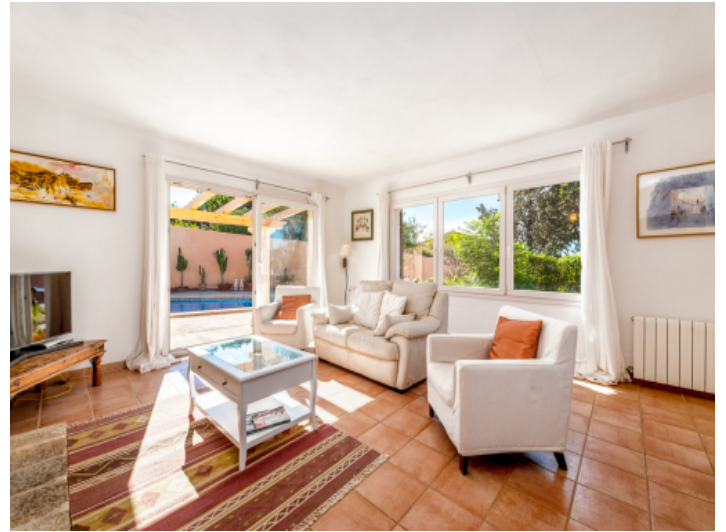
Lightflooded living area with terrace access