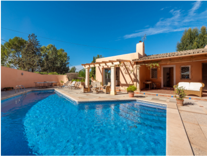
Wonderful sunny pool area