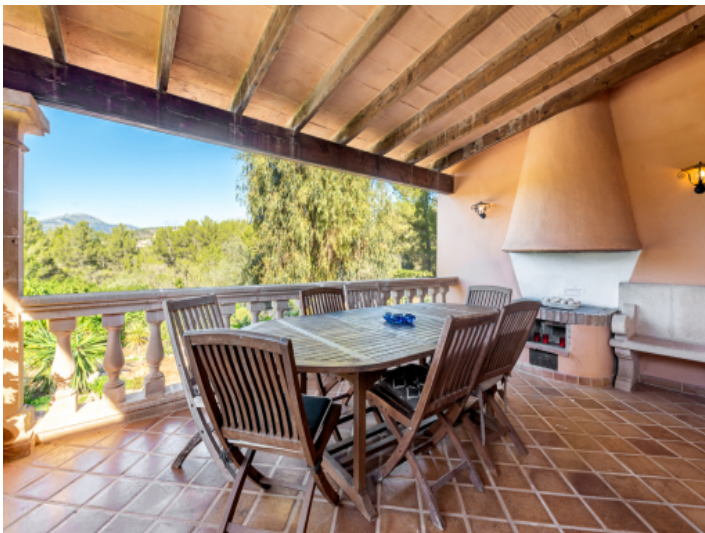
Wonderful terrace with a view