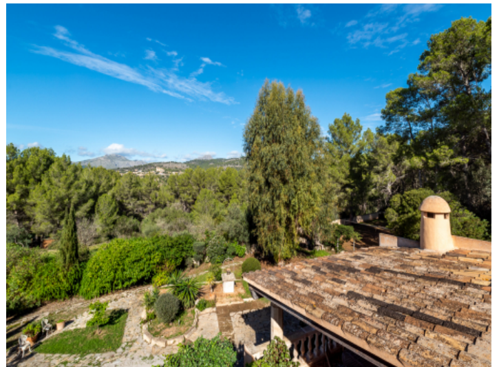
Sweeping views to the mountains