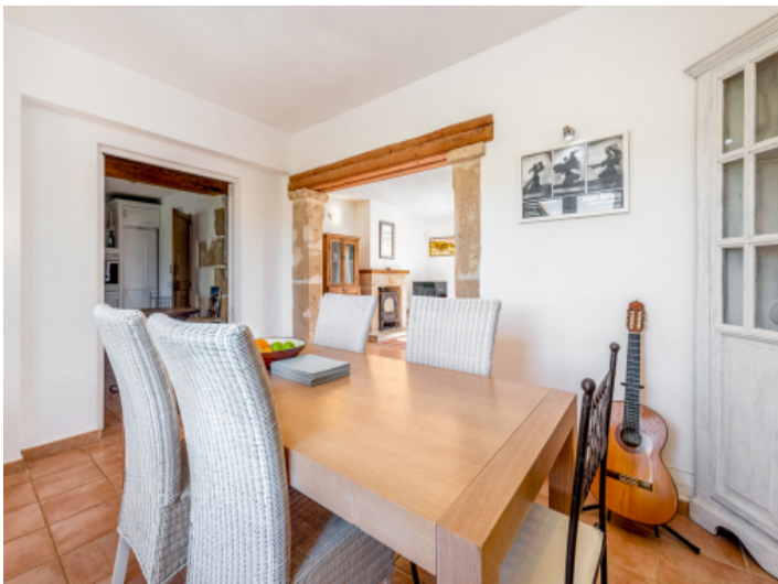
Beautiful dining area between living room and kitchen