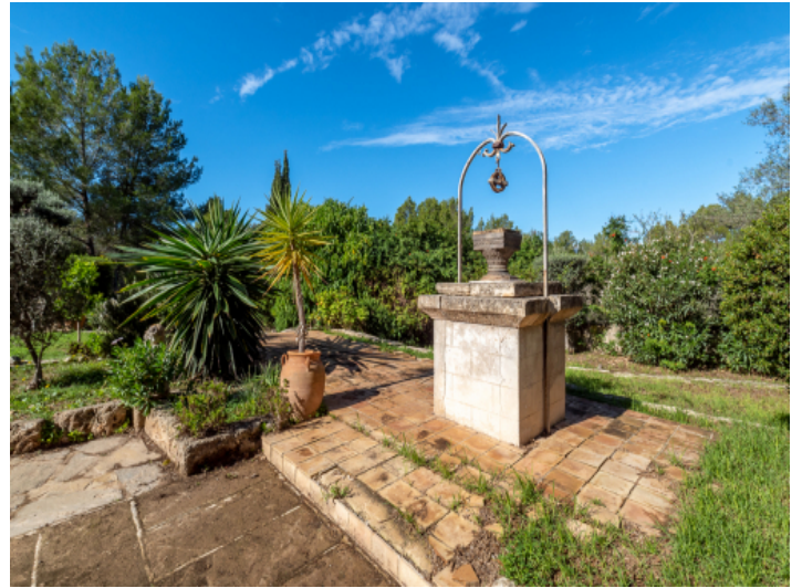
Garden with old fountain