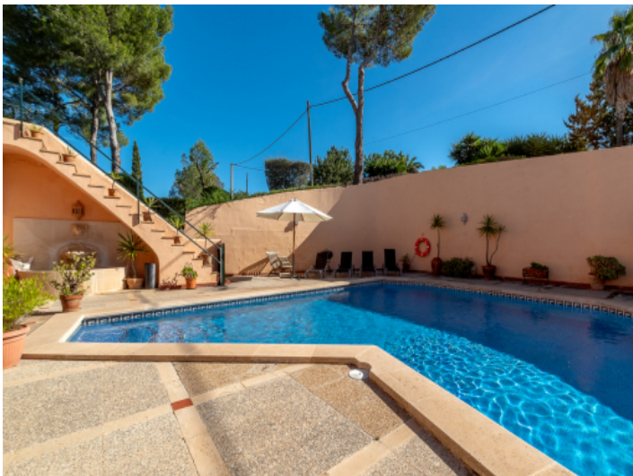
Large pool with privacy