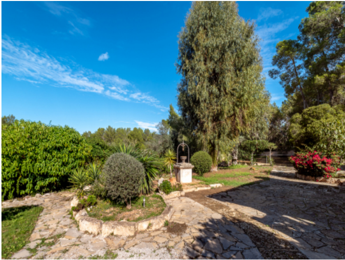
Beautiful green garden