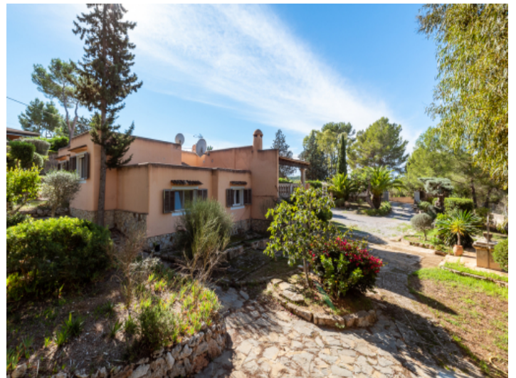
View of the house and garden