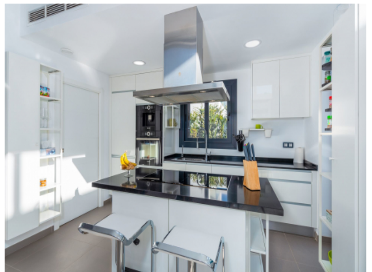
Modern American kitchen