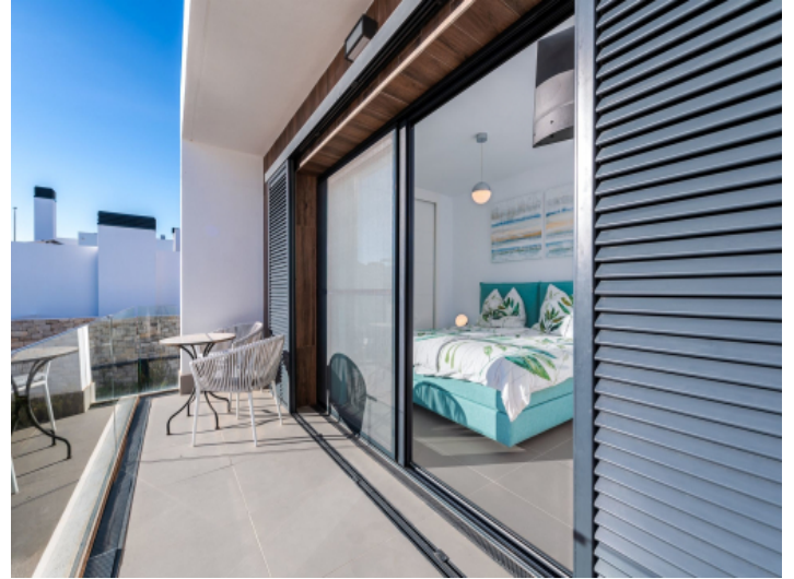
Sunny balcony of the bedroom