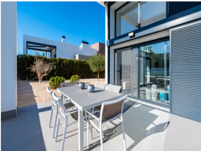
Ample sun terrace