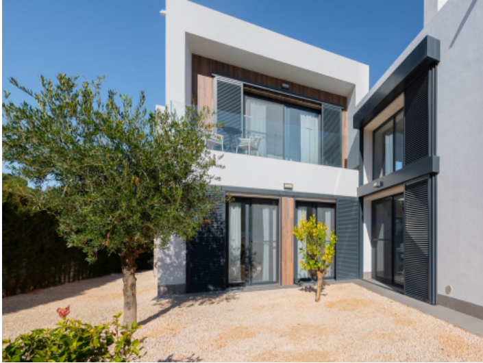
Modern designed villa