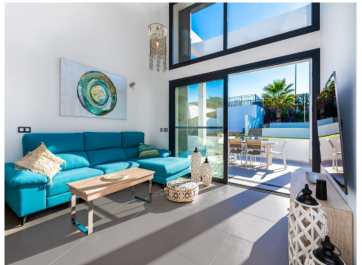
Living area with large window facade