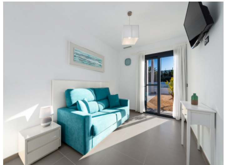
Bedroom with terrace access