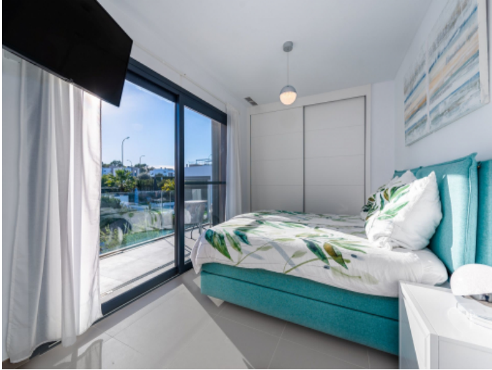
Bedroom on the upper floor