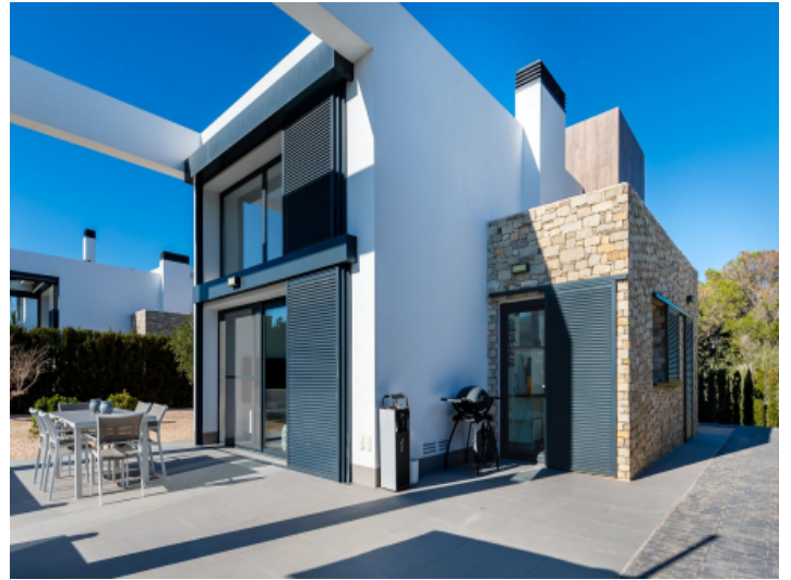
Exterior view and terrace