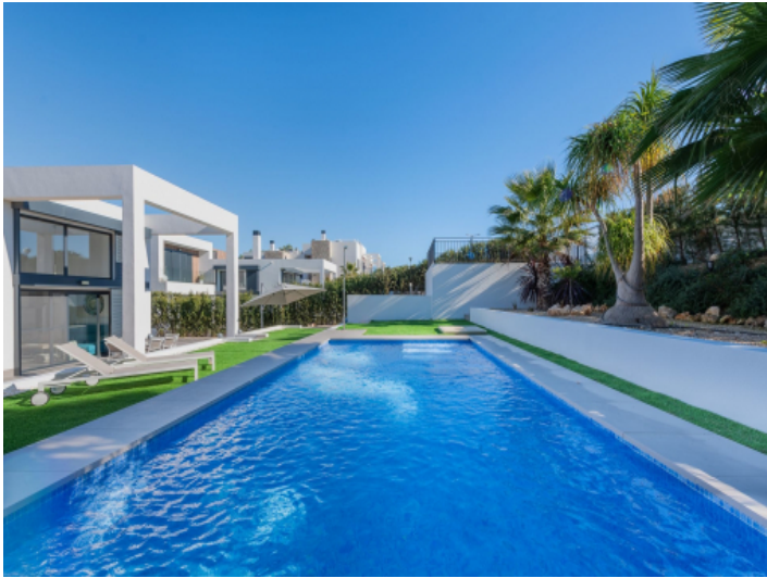
Large pool with sun terrace