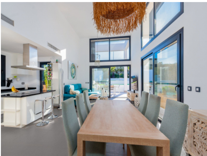
Open, modern living concept