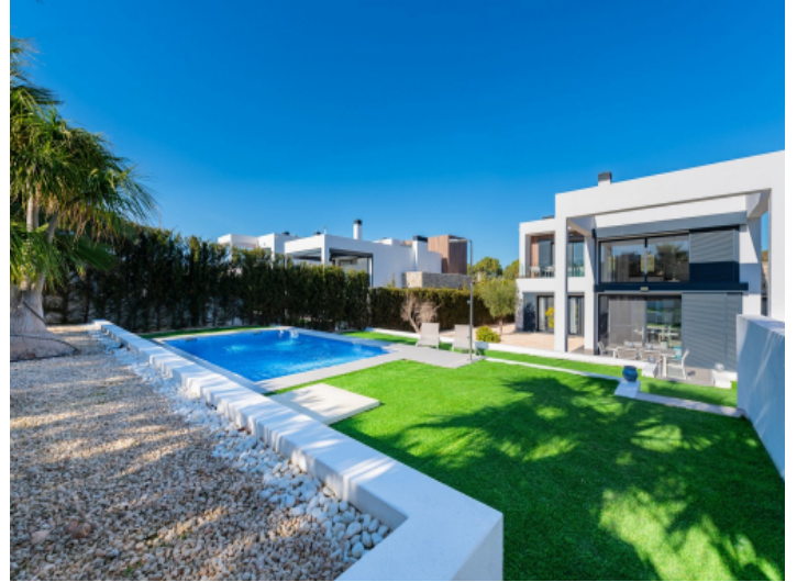
Pool and outdoor area