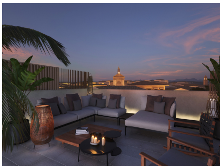
Amazing views from the rooftop