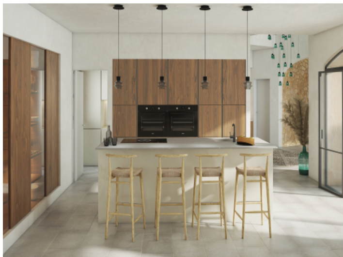
First-class building materials