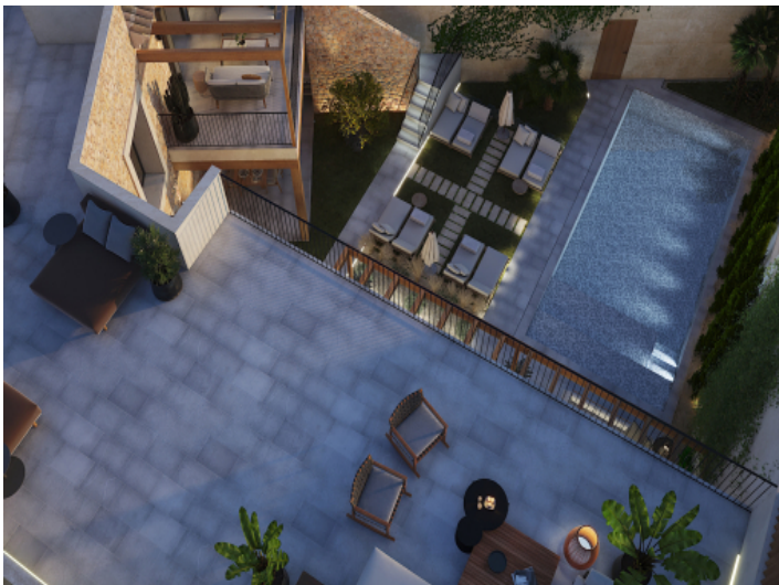
Eagle's eye view