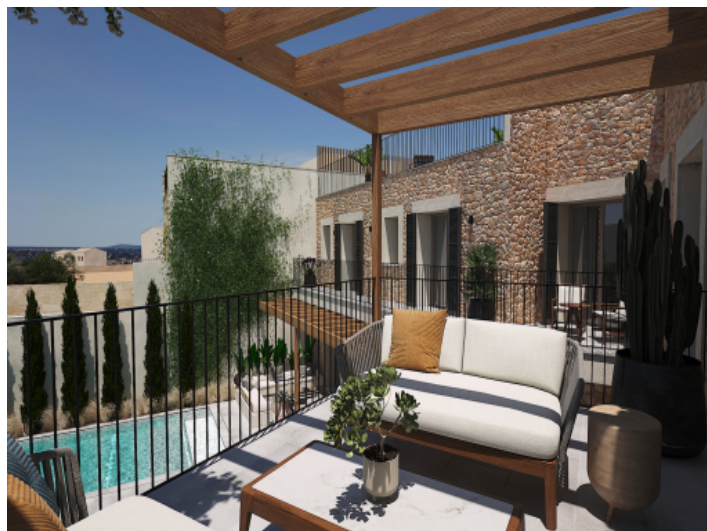
Private terrace of the mastersuite