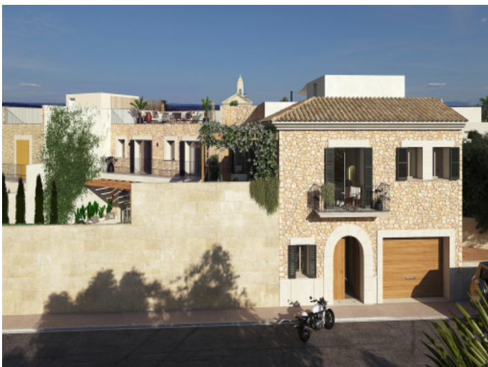
Fassade of this amazing project