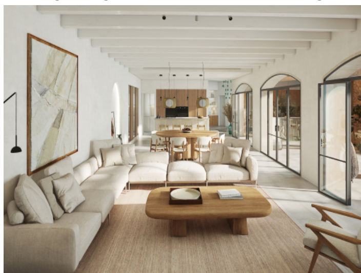
Open plan design