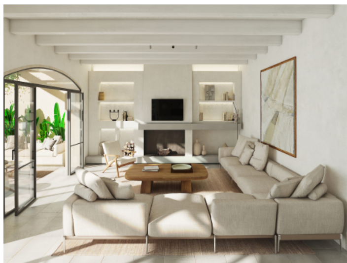
High ceilings, aircondition and underfloor heating