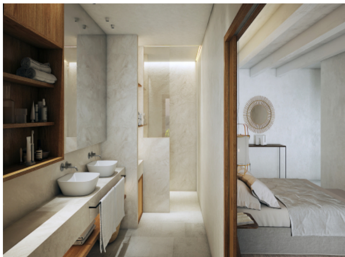
One of 4 bathroom