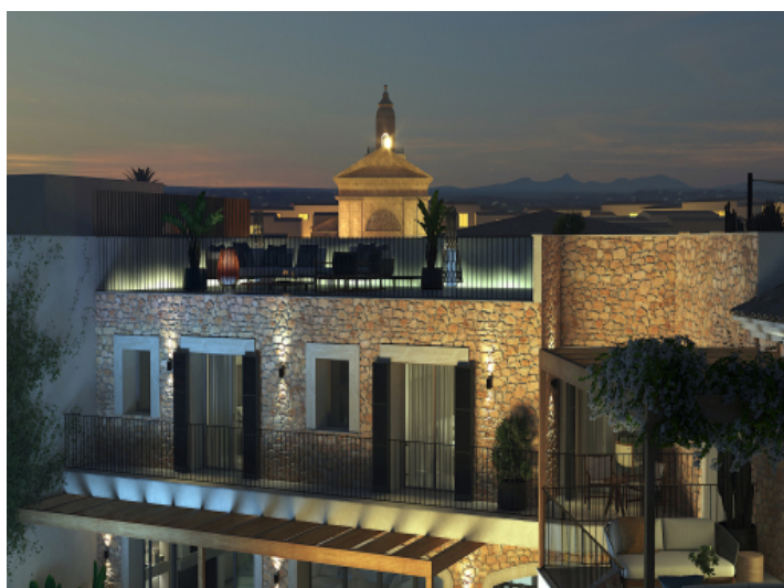
Mallorcan tradition meets modern architecture