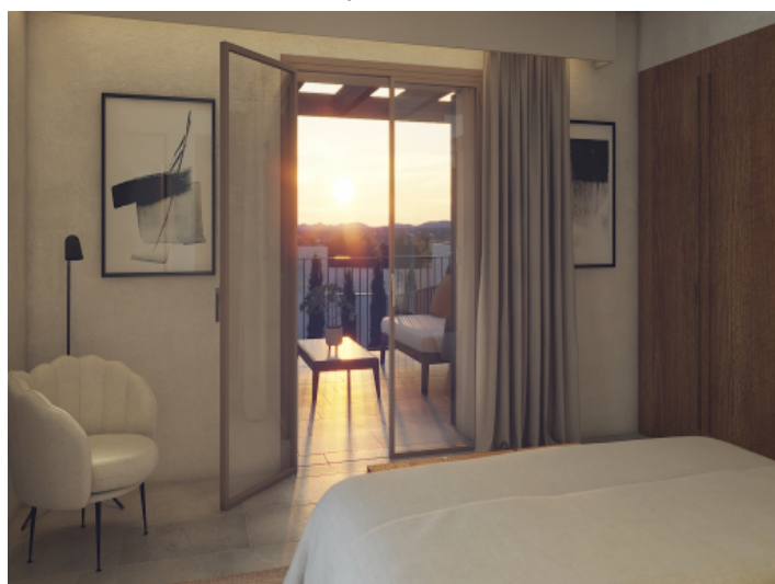
Mastersuite with private terrace