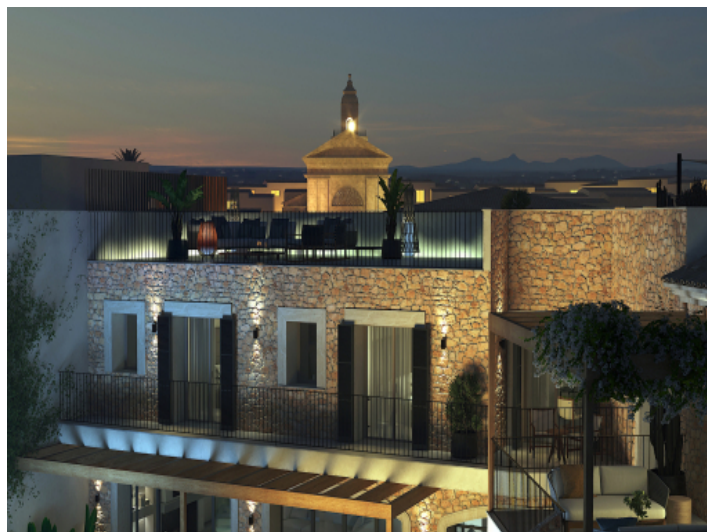
Mallorcan tradition meets modern architecture