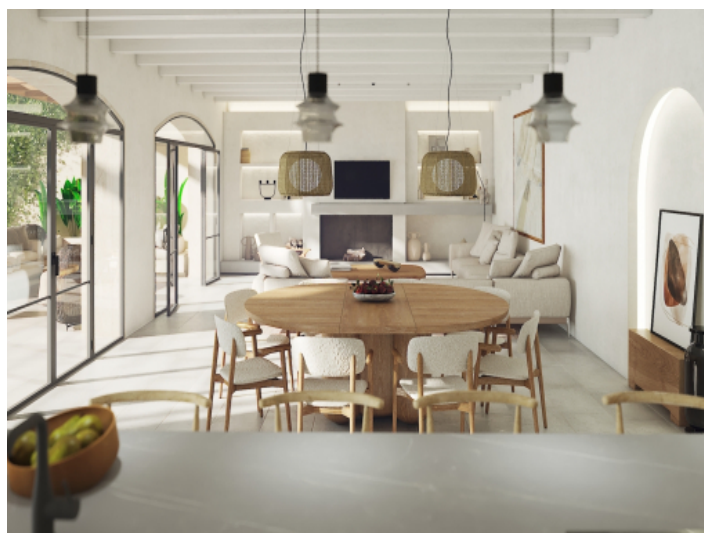
Spacious room design