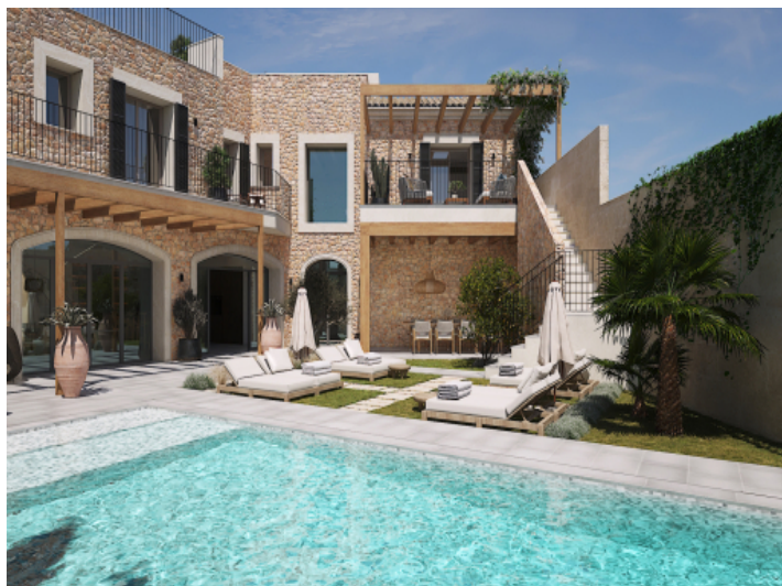
house, Ses Salines