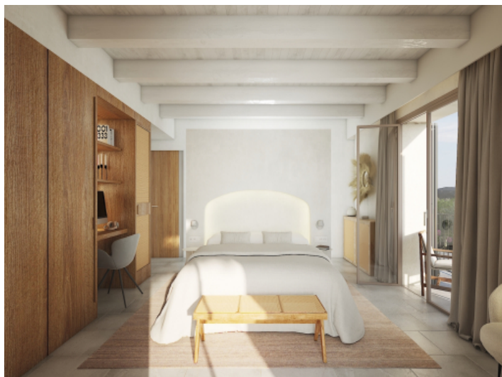
All bedrooms with bathroom en suite