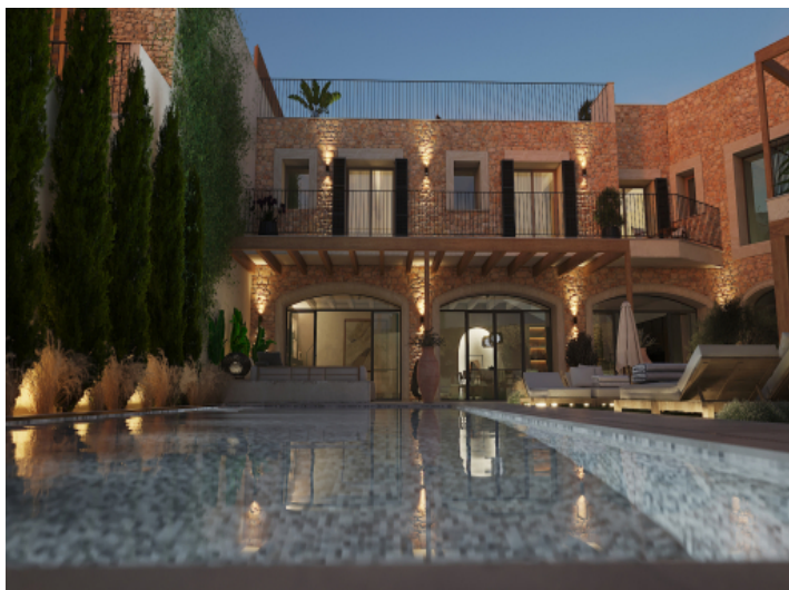
Elegant garden with heated pool