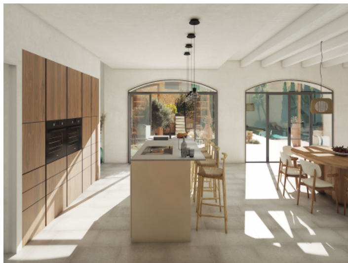
High quality kitchen