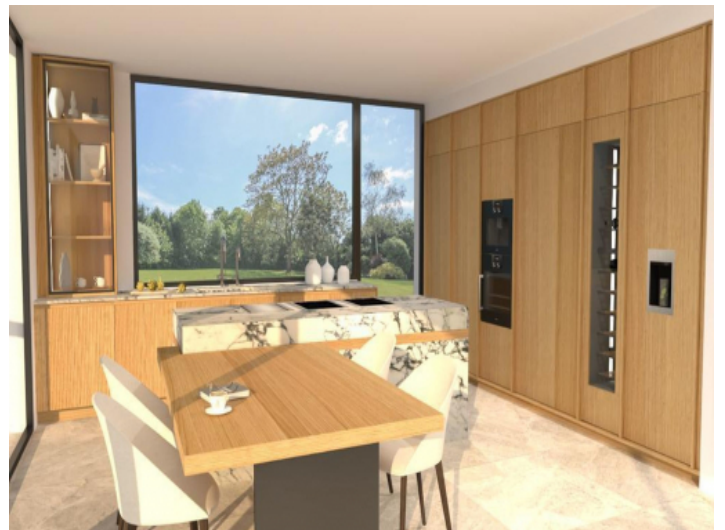
Kitchen and dining area