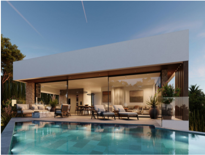
Pool area by night