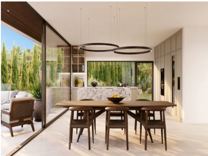
Dining area with terrace access