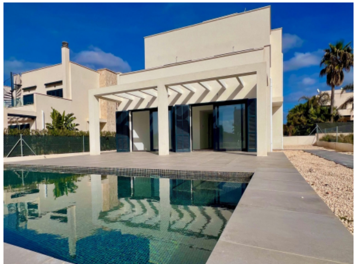
Exterior view of the modern villa