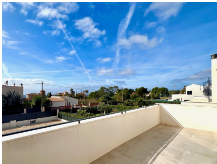
Beautiful roof terrace