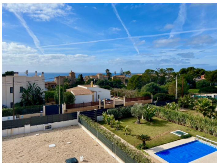
Lovely views from the upper floor