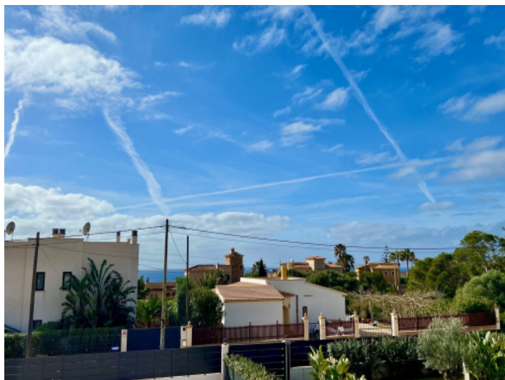
Partial sea views