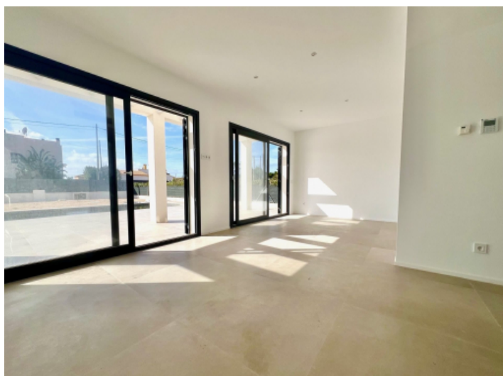
Light-flooded dining area