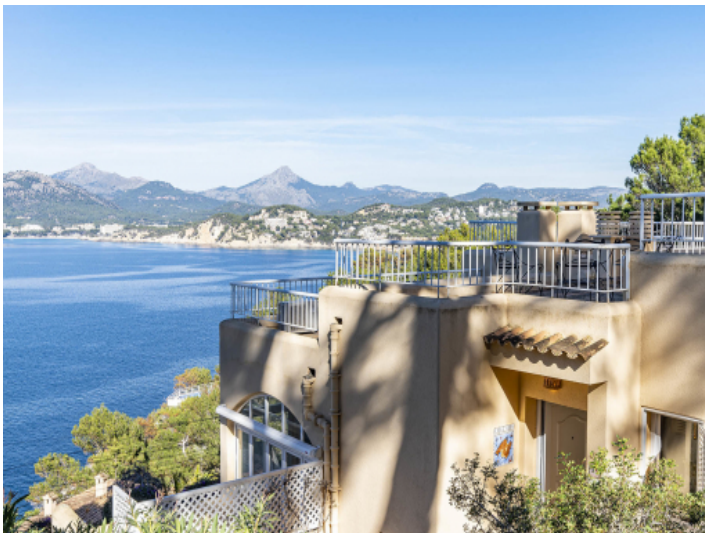
View to the community