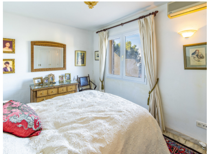
Masterbedroom with bath en suite