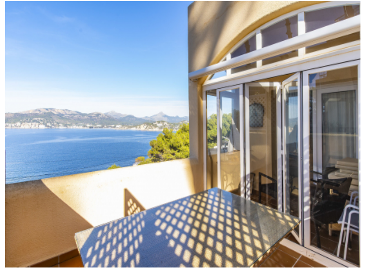
Balcony with amazing sea views