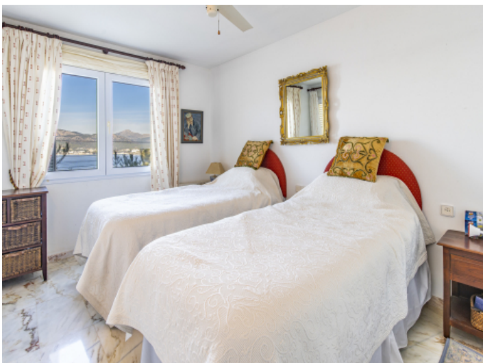
Sunny 2nd bedroom