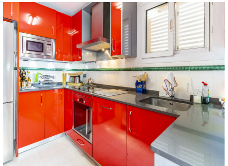
Fully equipped built-in kitchen