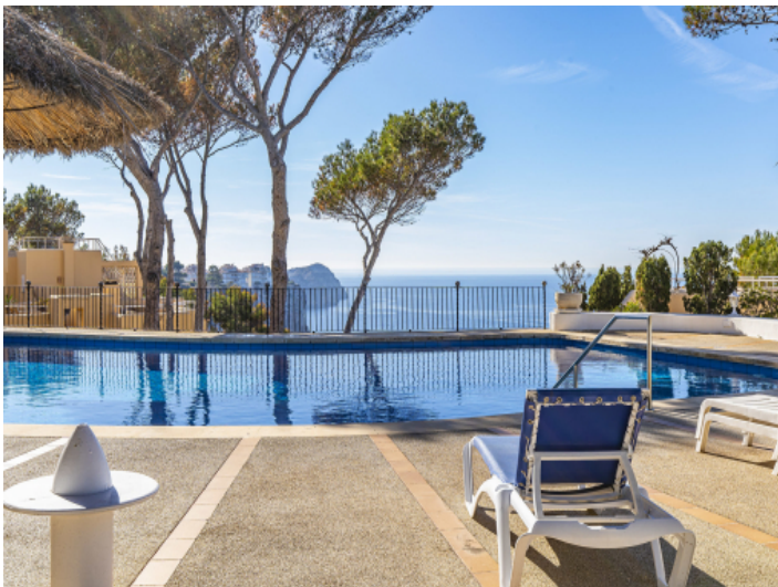
Well-tended community pool