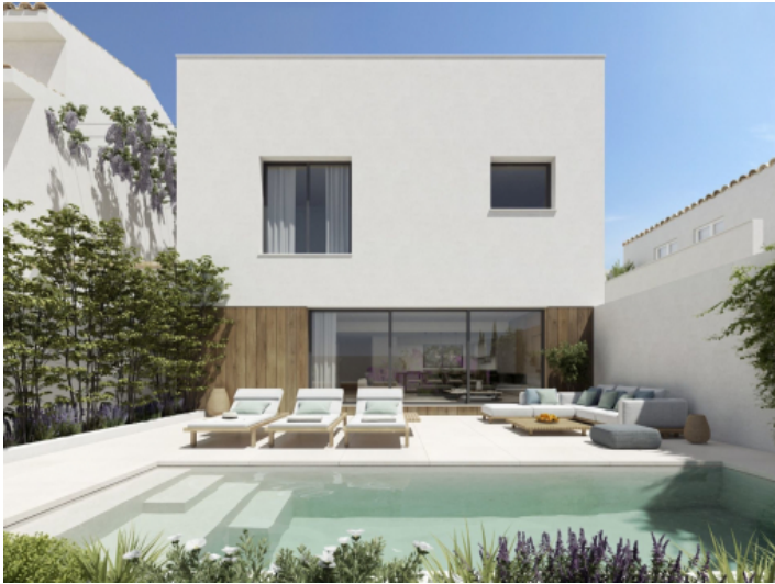
View to the house