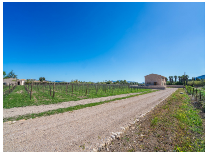
Entrance way to the finca