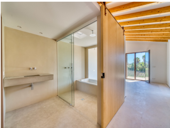
Bedroom with bathroom en suite