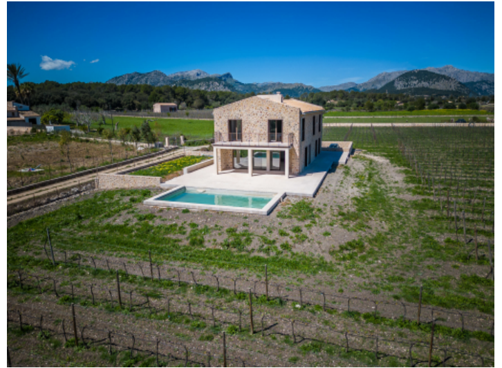
Great property close to the beach