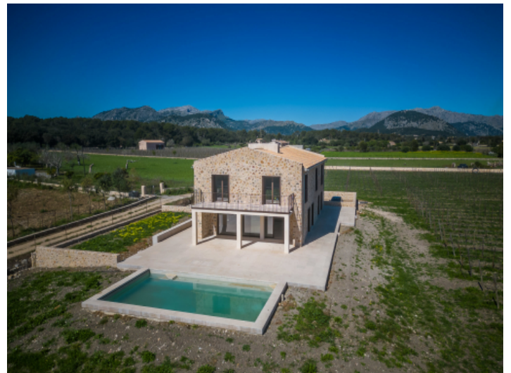
Aerial view to the property