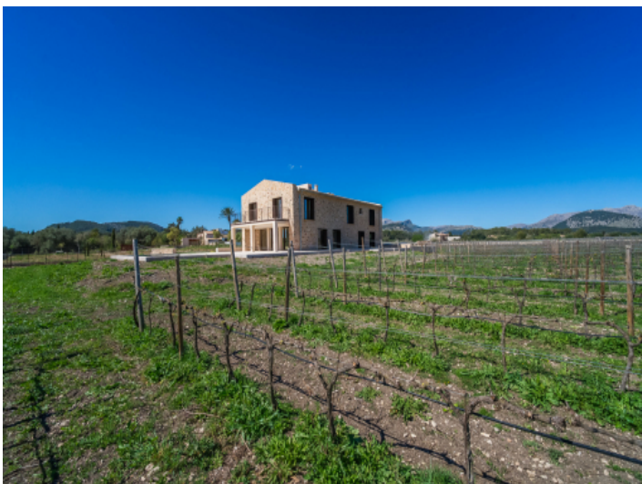
The vineyards around the property