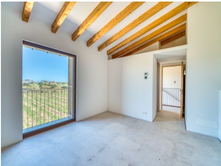
Great views from the bedrooms