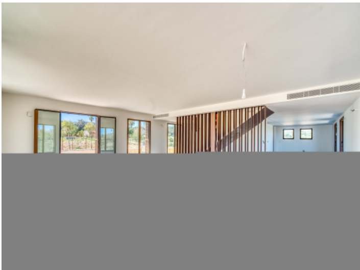
Living and kitchen area