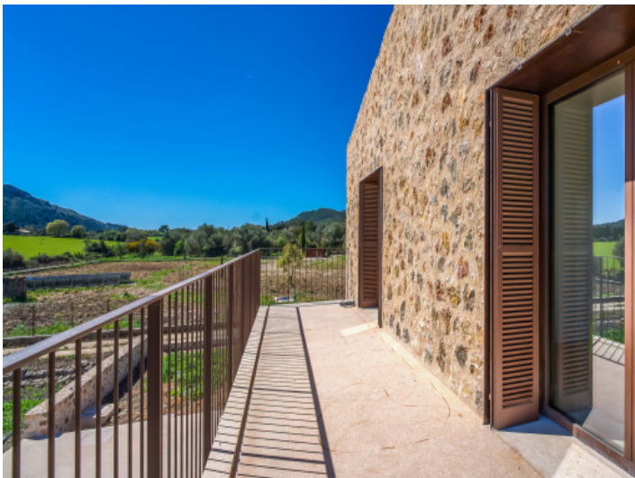
Views from the first floor