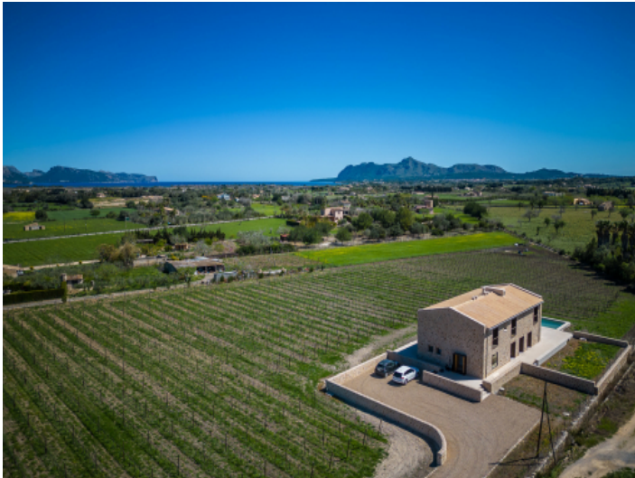
Property with panoramic views to Pollensa bay and