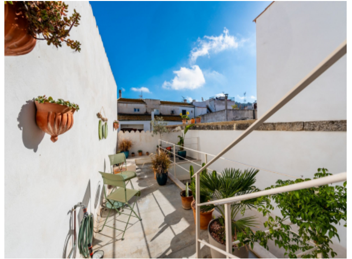
Lovely sun terrace