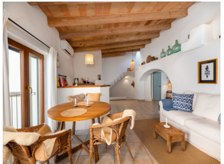
Living area with lots of character