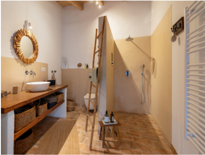
Enchanting shower bathroom