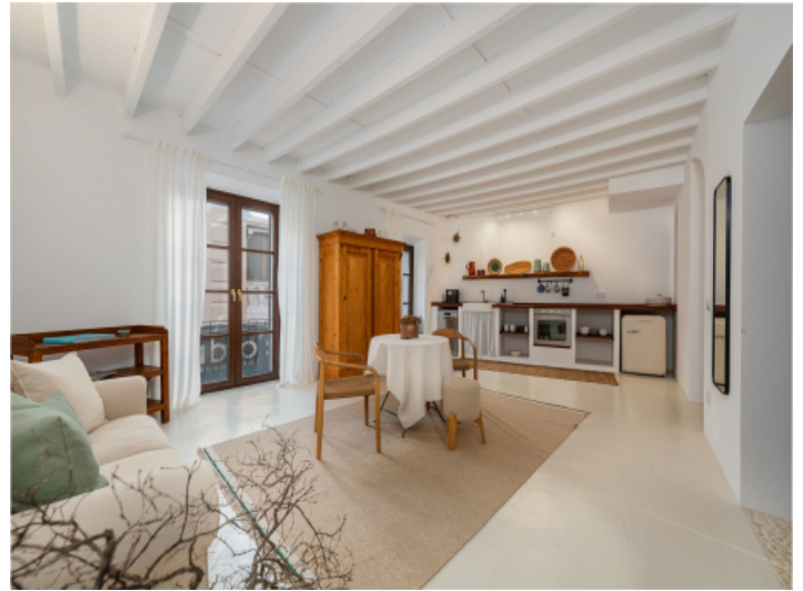
Second tastefully renovated apartment