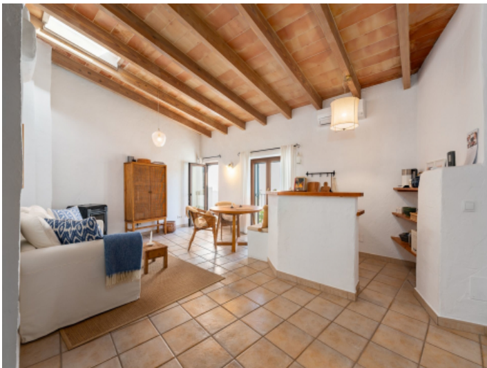
Access to a cosy apartment