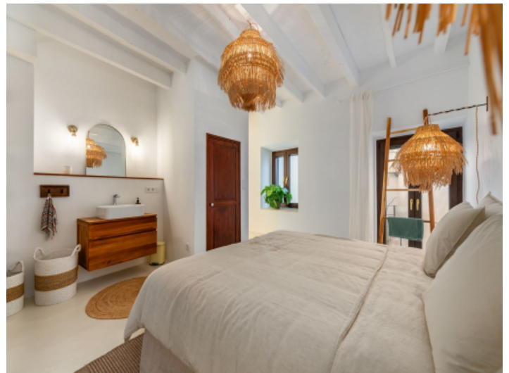
Wonderful bedroom with bathroom