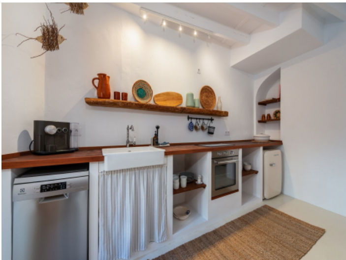
Mallorcan style kitchen