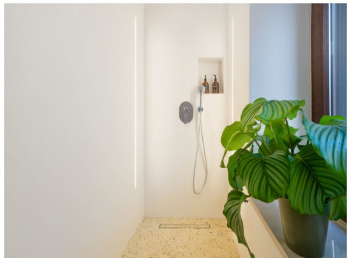
Modern shower bathroom