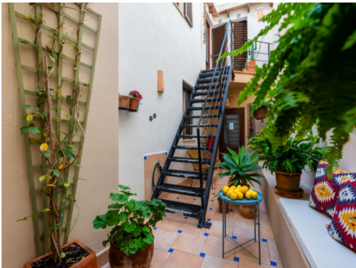
Patio of the Cafe