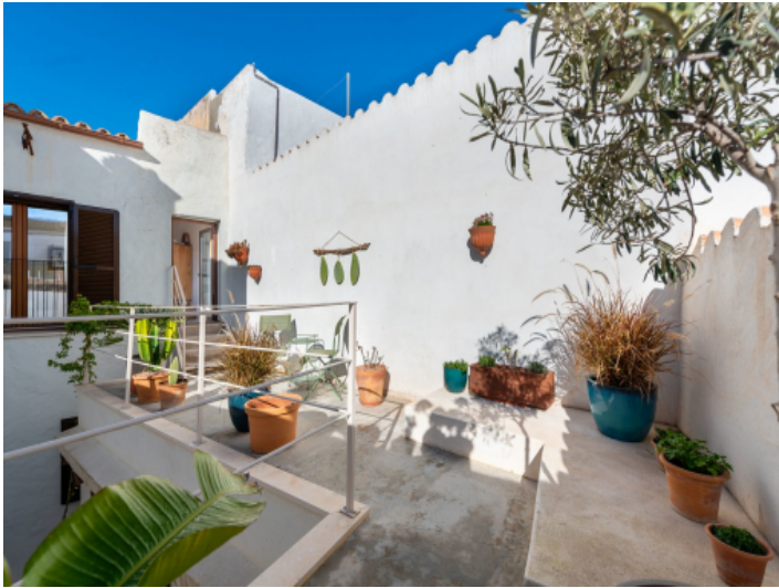
Alternative terrace view