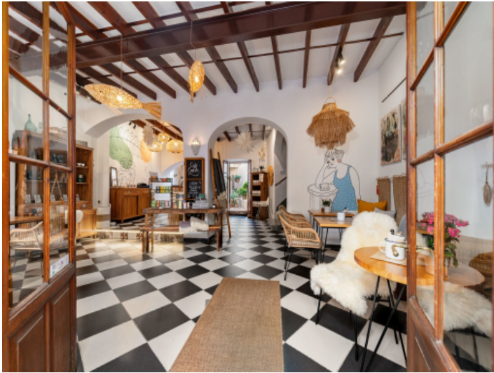
Attractive cafe on the ground floor