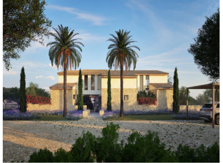
Privileged location and contemporary design