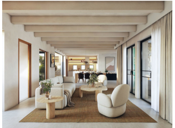
Wood and stone skilfully combined in the living area