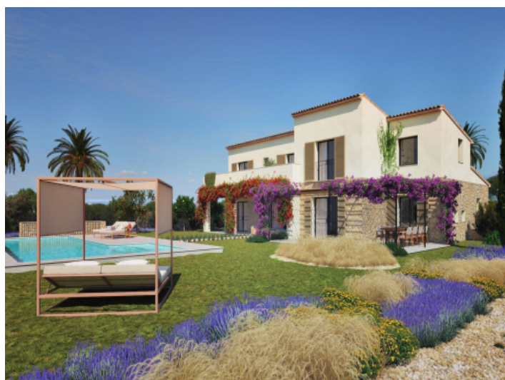
Elegant country house offering the highest standards of comfort