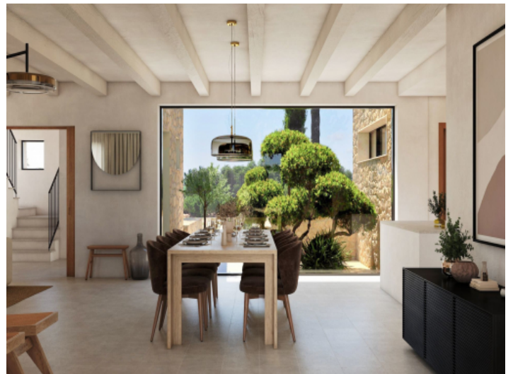
Living area with much of light and mediterranean flair