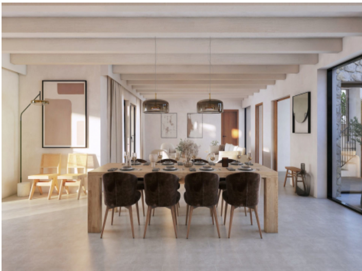
Open plan design