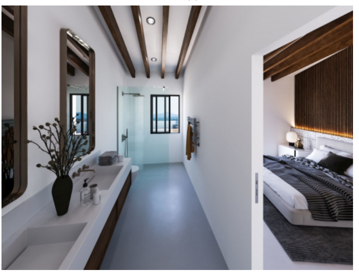
Modern en suite bathroom