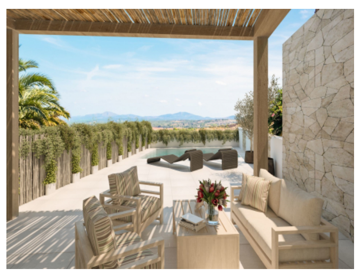
Terrace and pool area