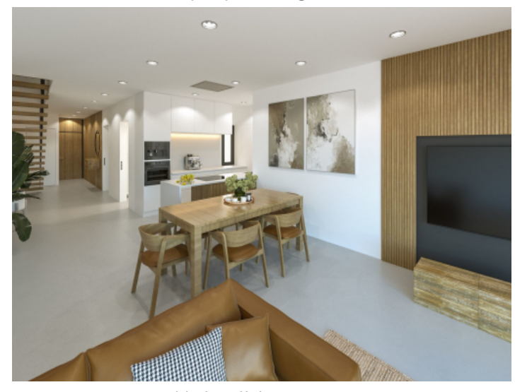
Modern living concept