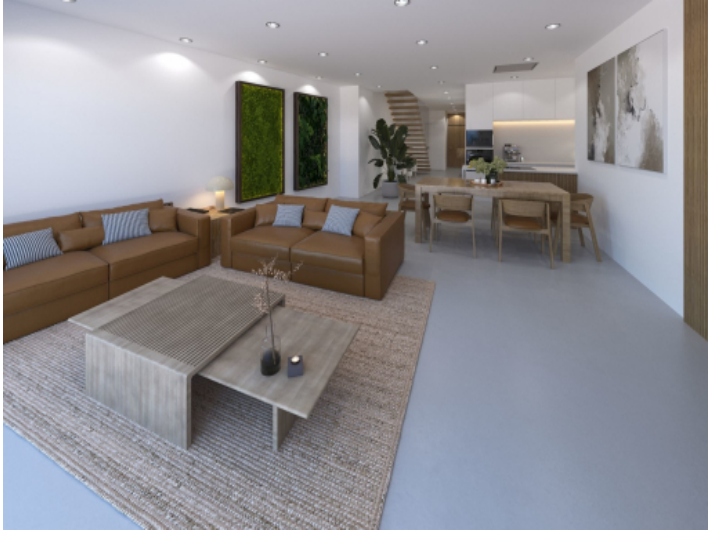
Open plan living area