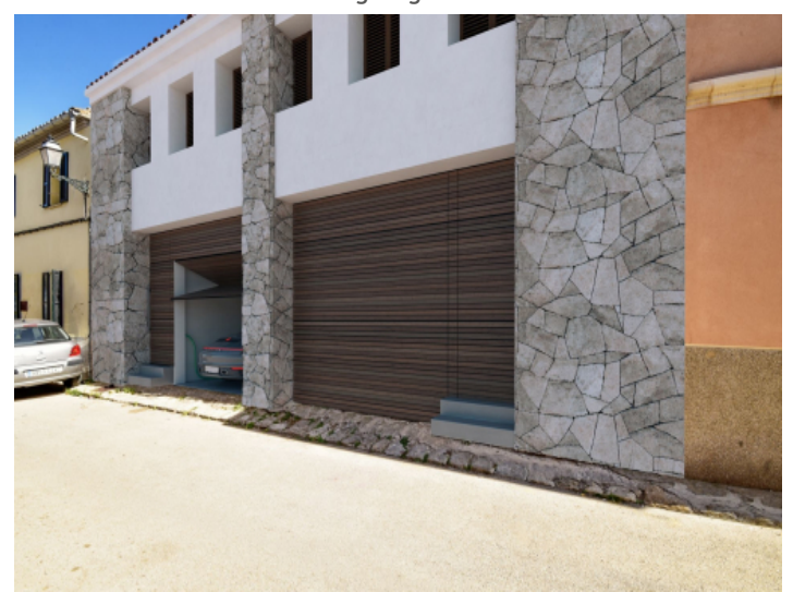
Front view and garage