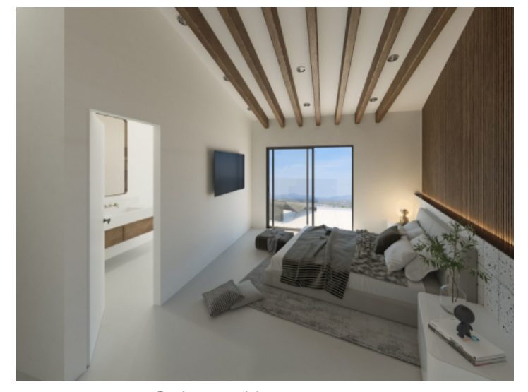
Bedroom with upper terrace