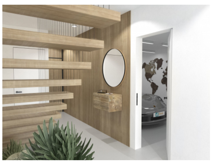
Direct garage access