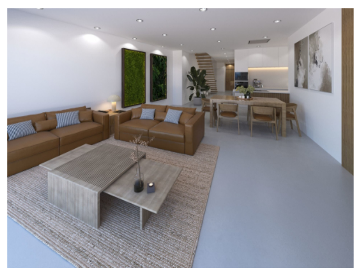
Open plan living area