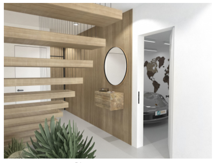
Direct garage access