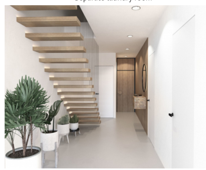
Corridor and staircase