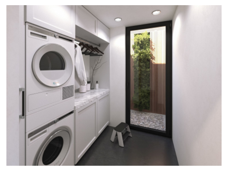
Separate laundry room