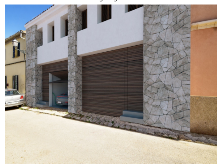
Front view and garage