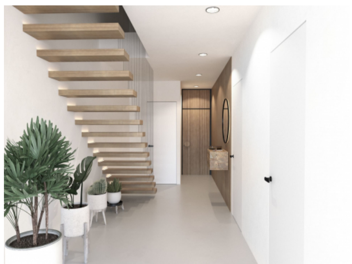
Corridor and staircase