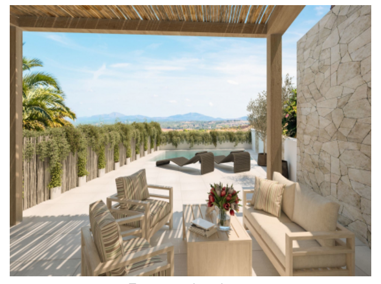
Terrace and pool area