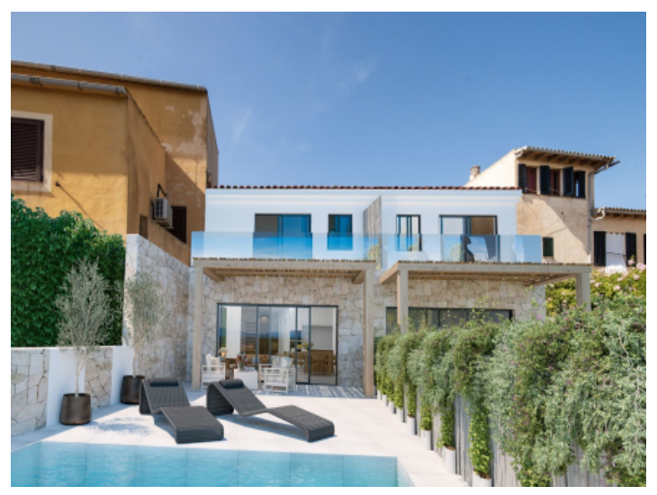
house, Maria de la Salut