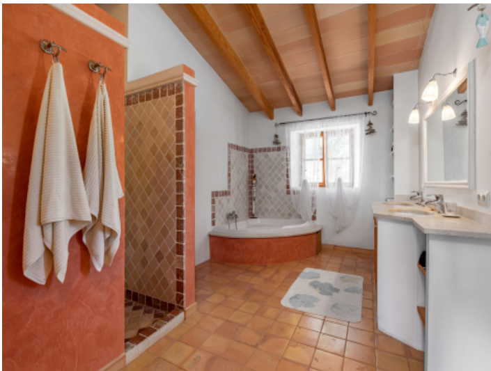
One of 4 bathroom