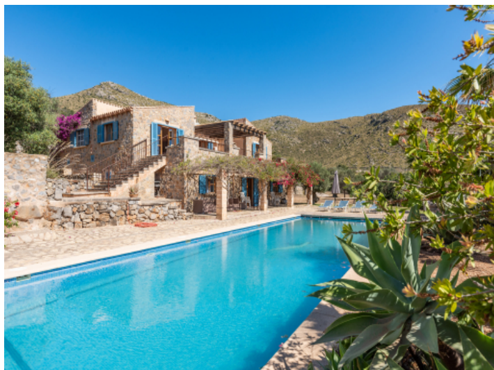
Pool area and facade