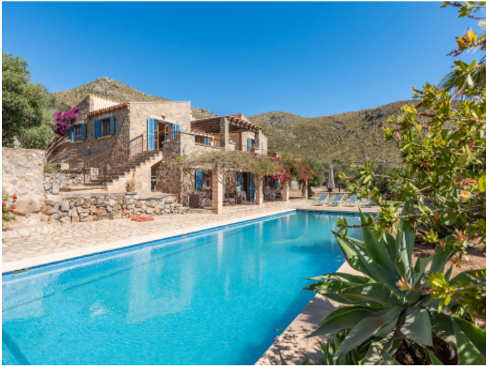
Pool area and facade