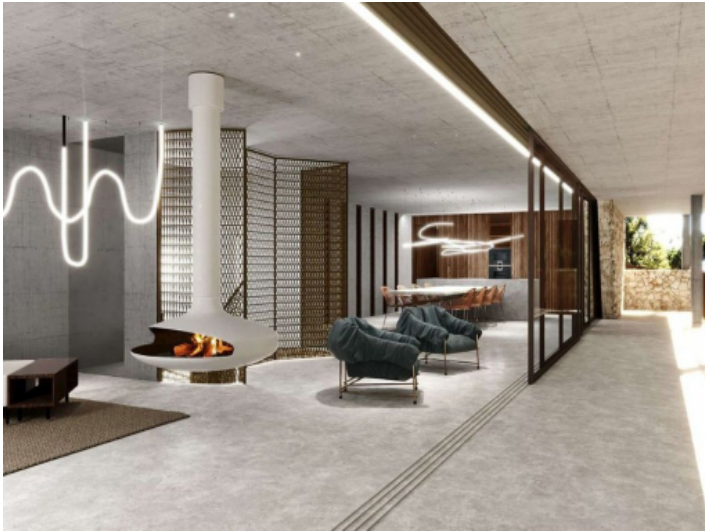
Villa with 4 bedrooms and 4 bathrooms