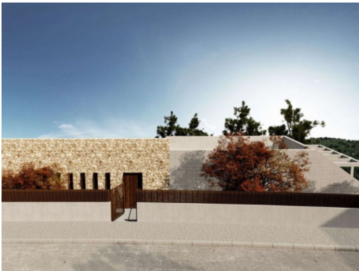
Render of the facade