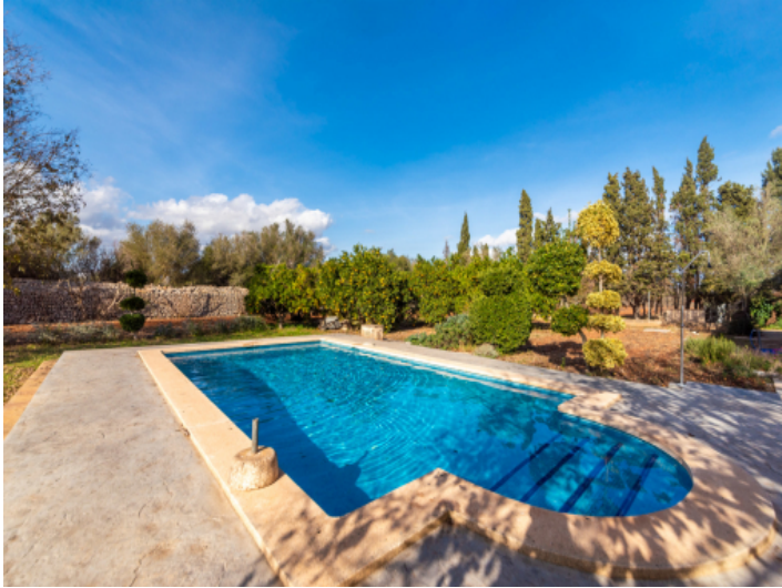
Pool and garden with fruit trees