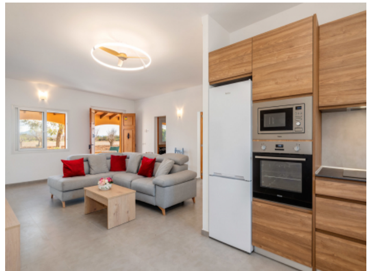
Open living and kitchen area