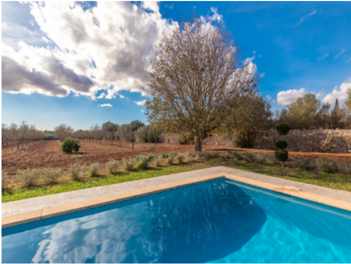
Garden views from the pool