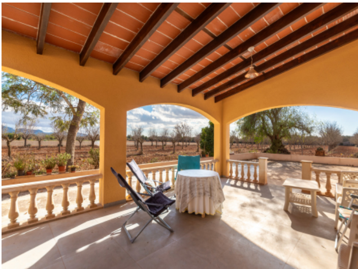
Large covered veranda