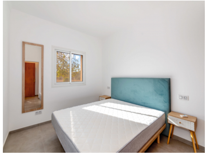
Bedroom with daylight