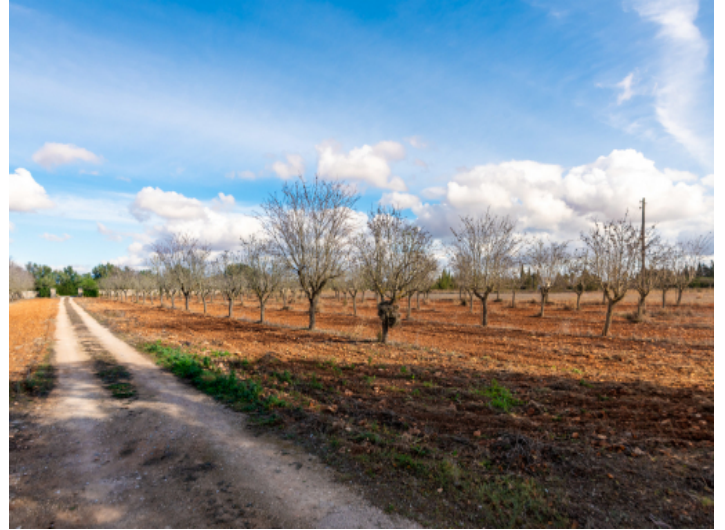
Access to the finca