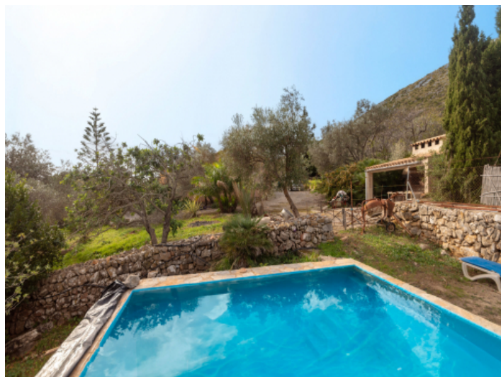
Fantastic pool area