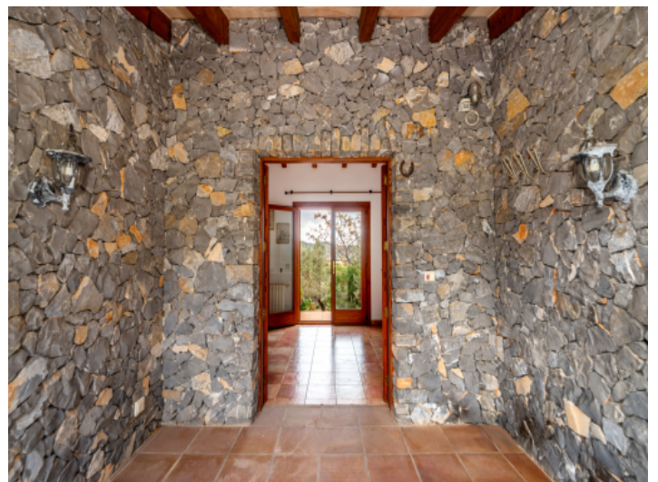
Entrance from the finca