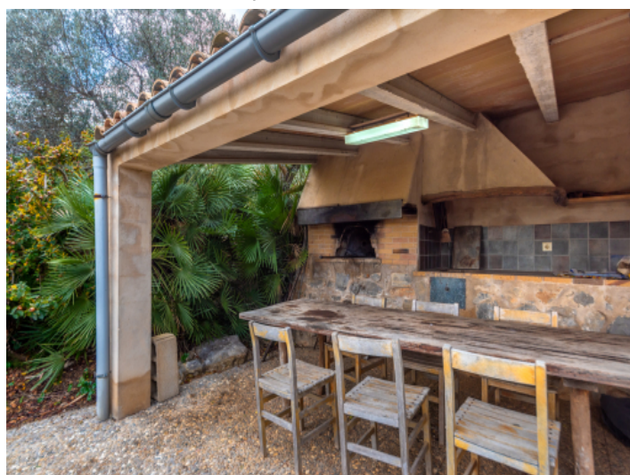
Mallorquin outdoor kitchen