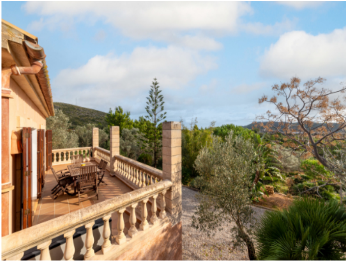
Views over the garden