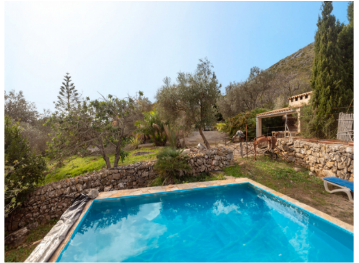
Fantastic pool area