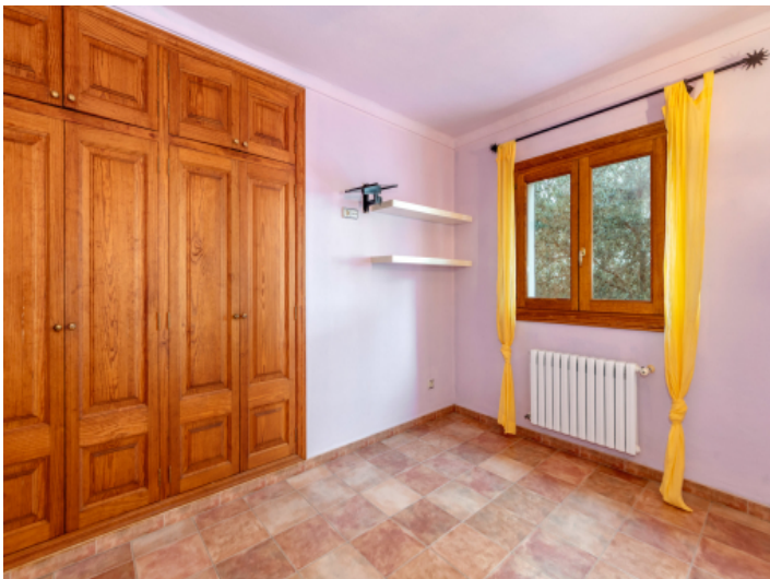
Bedroom with built-in wardrobe