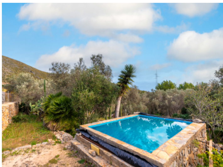
Idyllic pool area