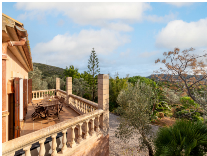
Views over the garden