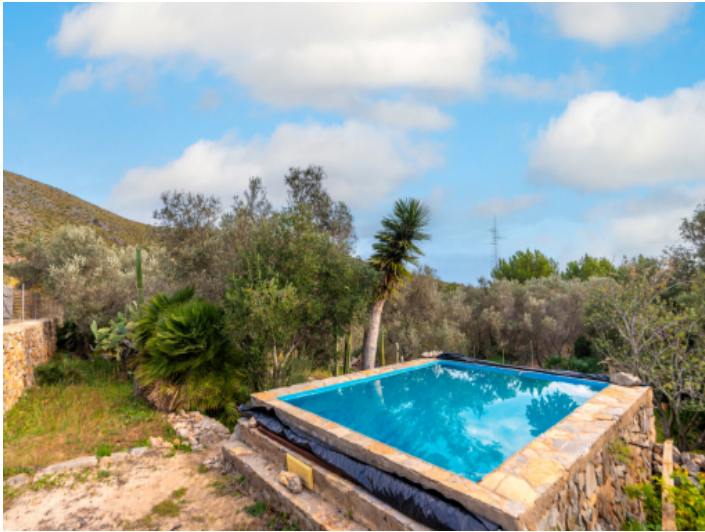
Idyllic pool area