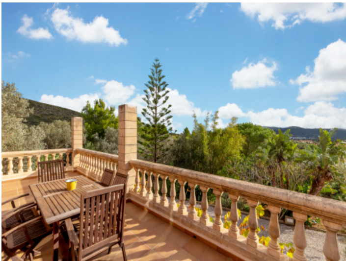
Unique landscape views from the balcony