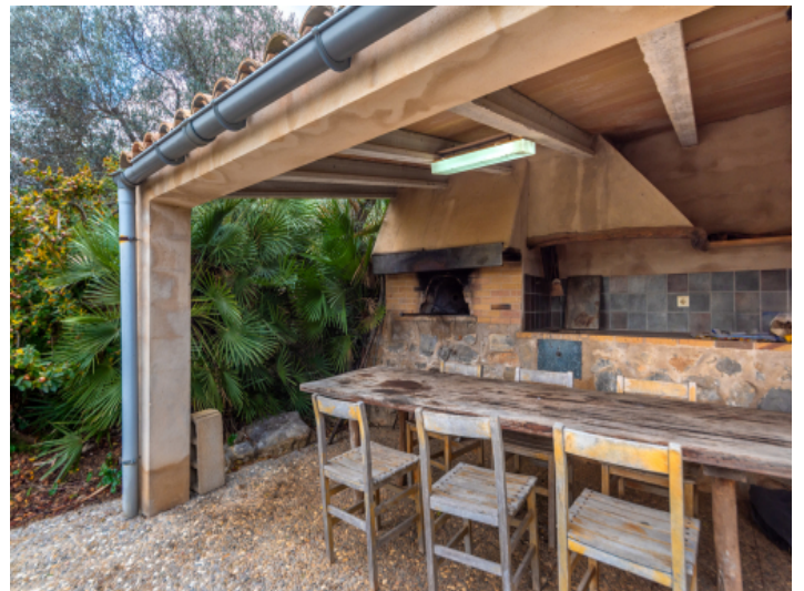
Mallorquin outdoor kitchen