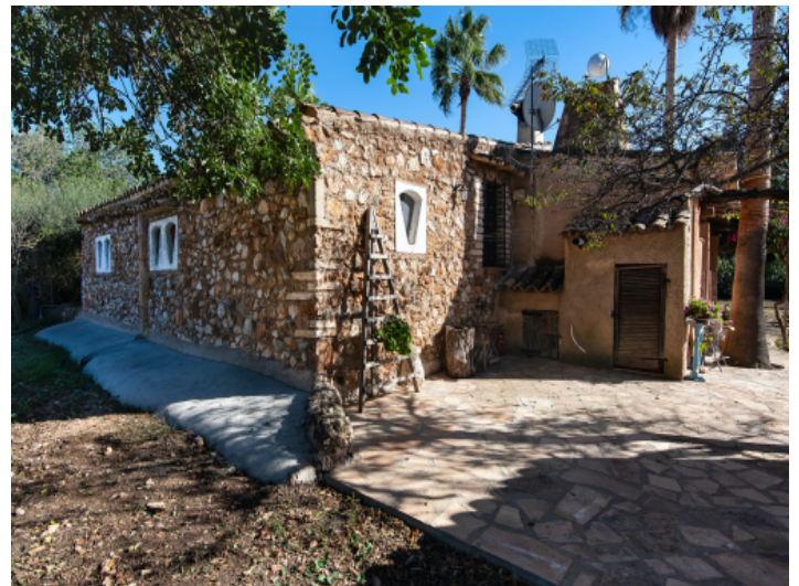
Exterior view of the finca