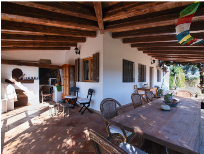
Large covered terrace