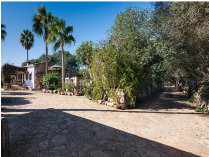
Large plot size