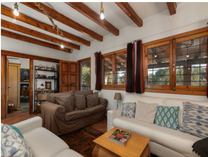
Living area with wooden beams