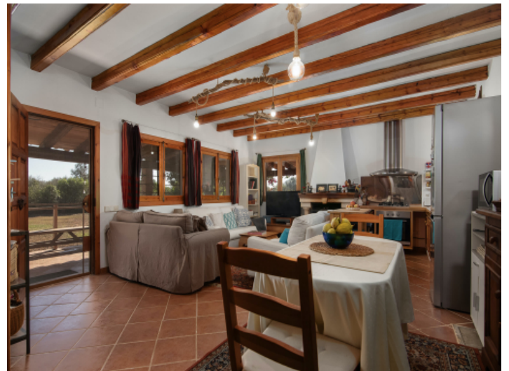
Open plan living, dining area and kitchen