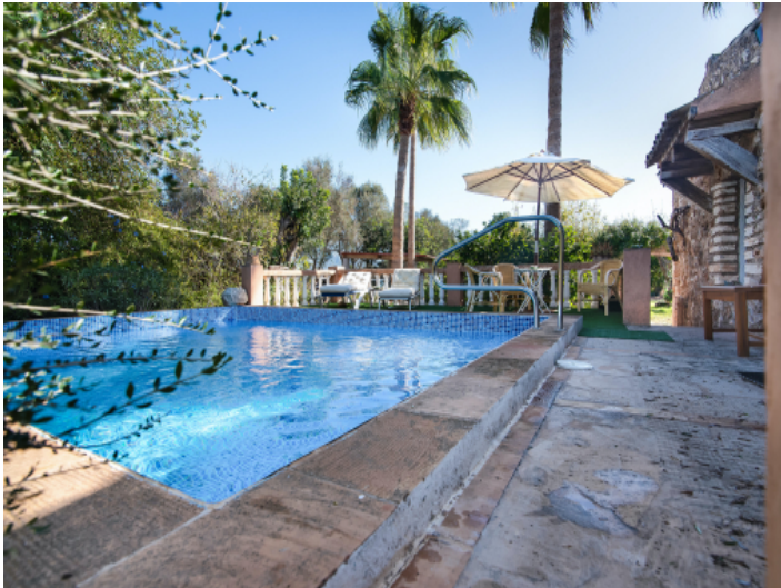
Beautiful pool area