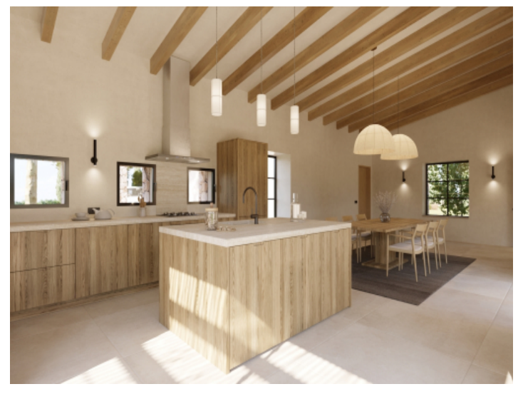
Kitchen with cooking island