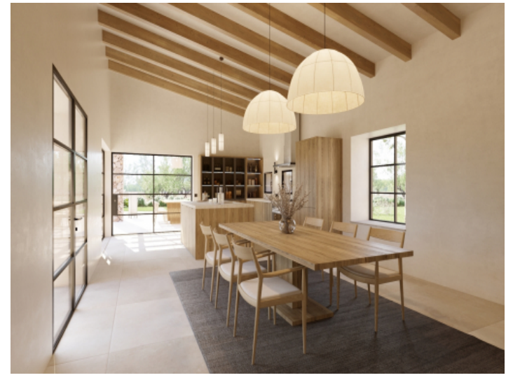
Open kitchen and dining area