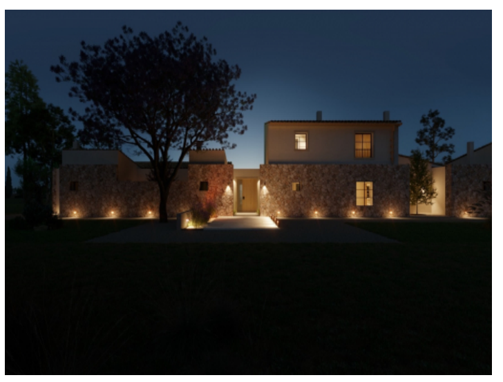
Alternative view of the finca by night