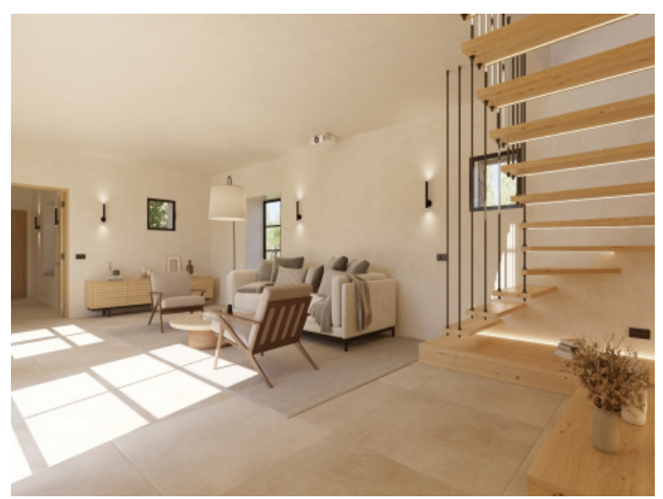
Light flooded living area