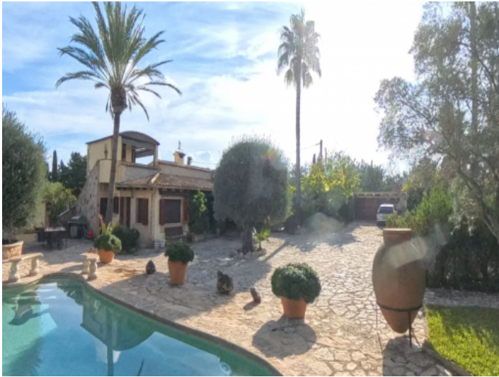
View to the house