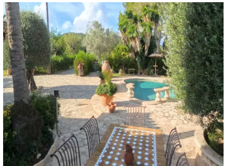
Outdoor dining area