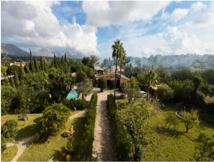
Property in great location