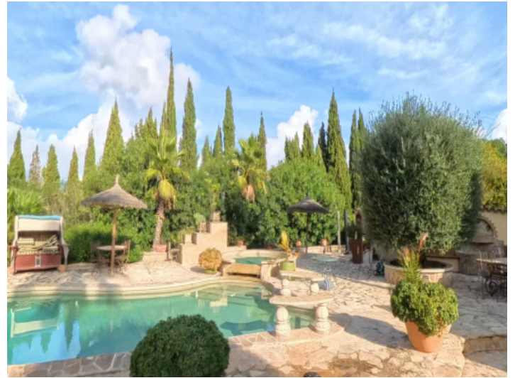
Beautiful pool area