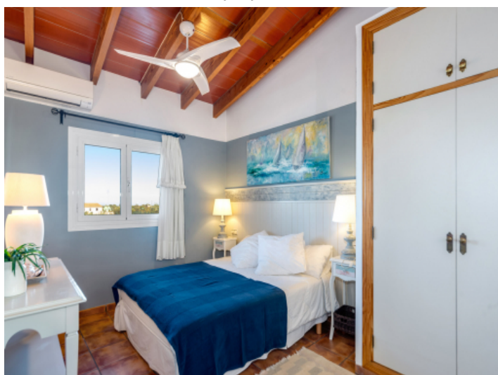
Bedroom equipped with ventilator for fresh summer nights