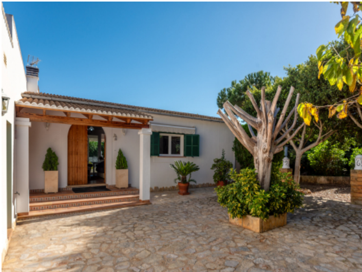
Spacious main entrance