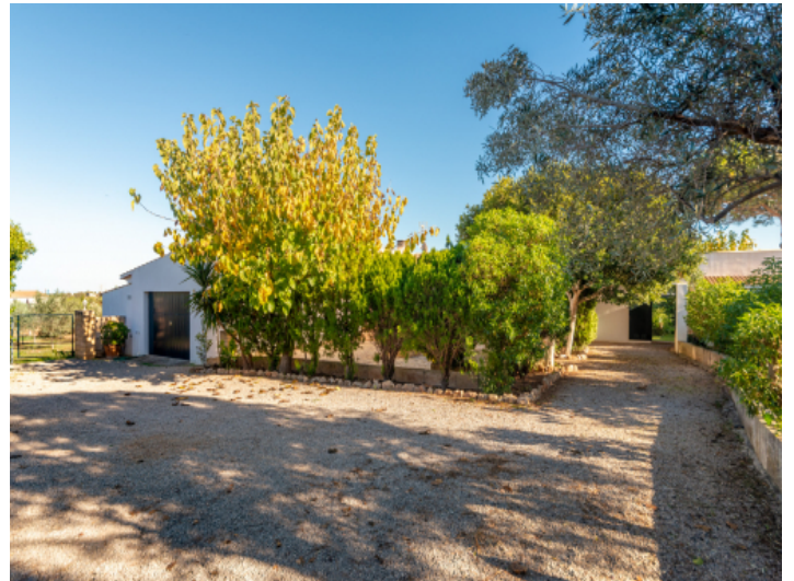
Garage and outdoor parking spaces