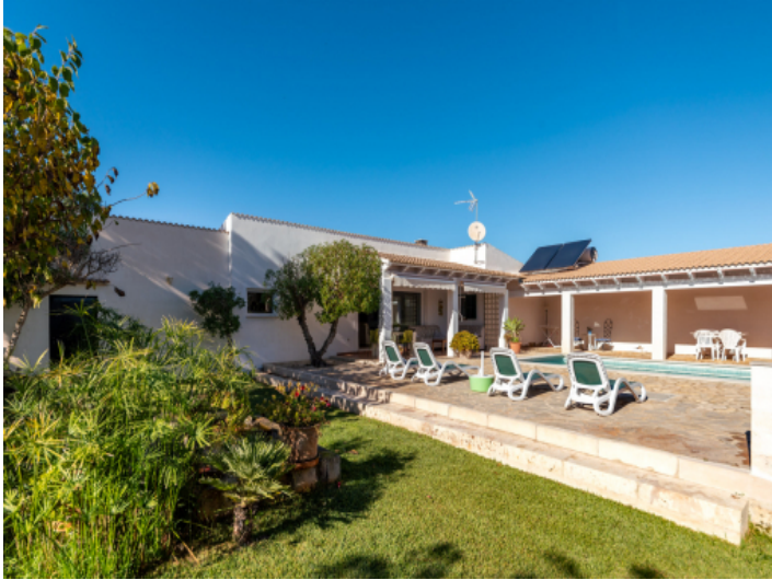
Well maintained garden