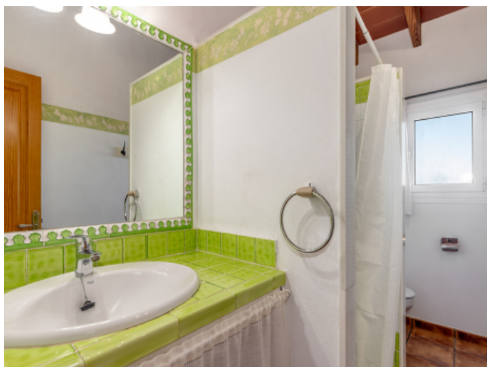
2nd bathroom en suite with shower