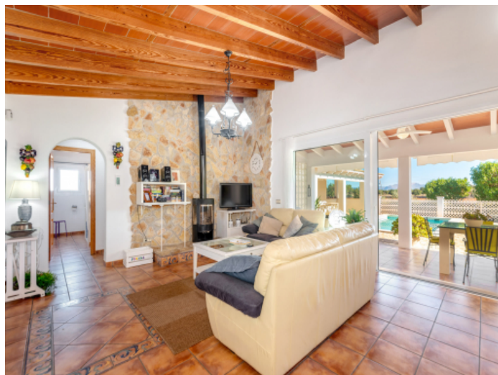
Cozy living area with fireplace