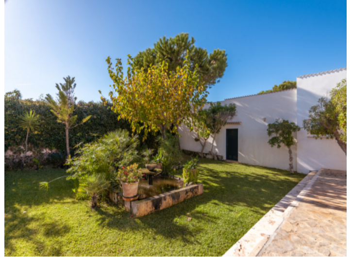
Mediterranean plants and trees