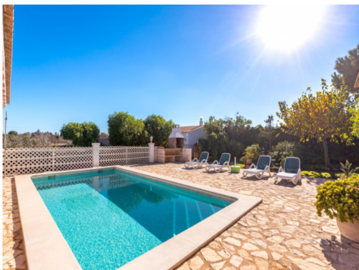
Pool surrounded by natural stone terrace