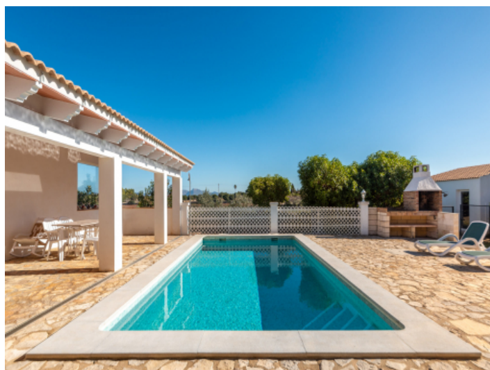
Great outdoor area