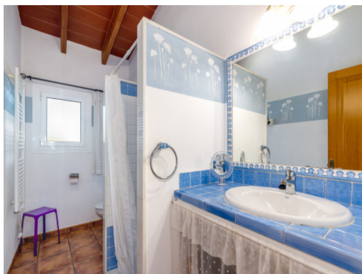
Country style bathroom with shower