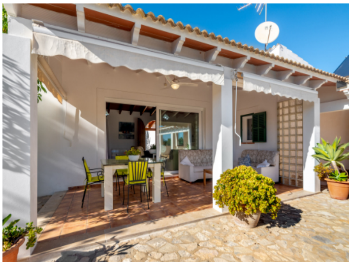
A shady spot