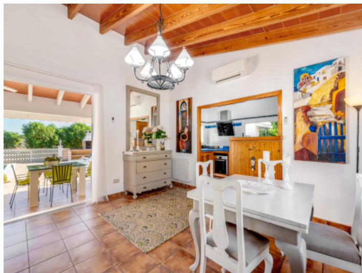
The dining area adjoins the kitchen