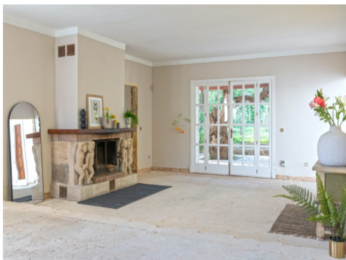
Living area with fireplace