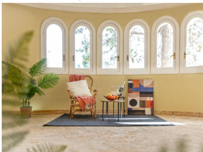
Bright sitting area