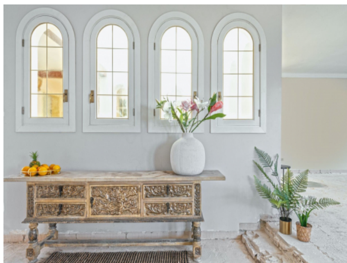
Additional view of the living area