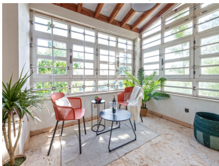
Light-flooded dining area