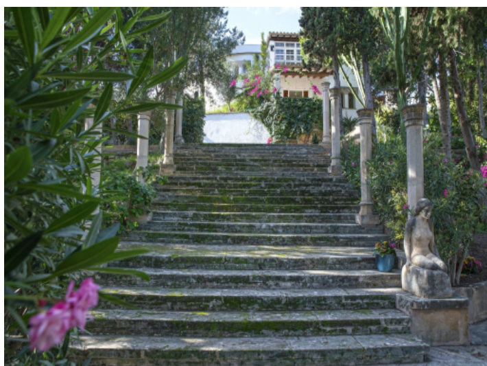
Stairs leading to the villa