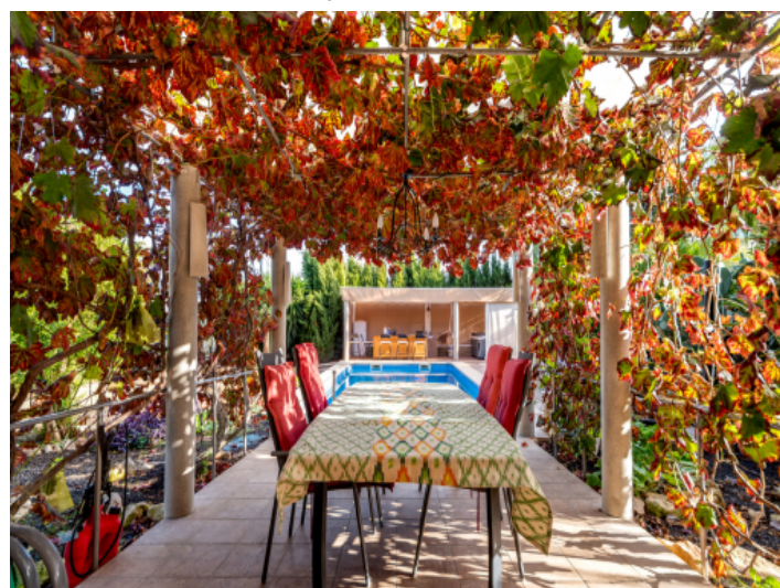
Idyllic outside dining area