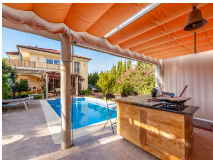
Covered summer kitchen