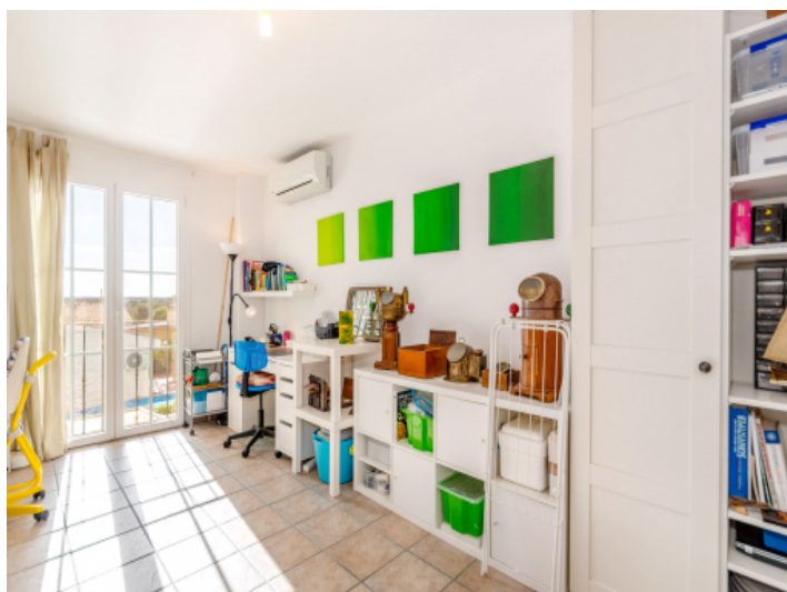
Office or children's room on the upper floor