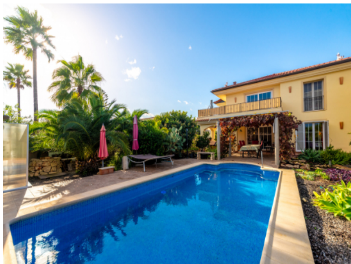
Well-tendet pool area