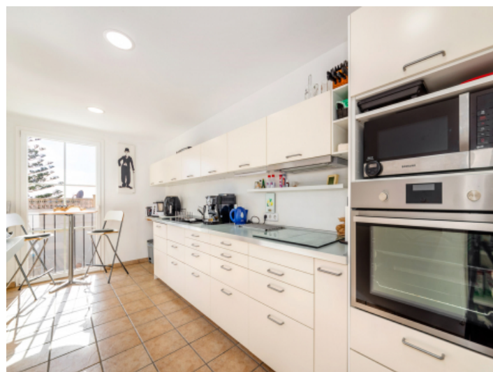
Kitchen on the upper floor