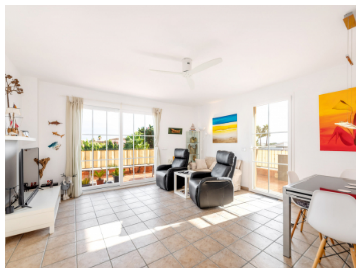
Light flooded living area on the upper floor