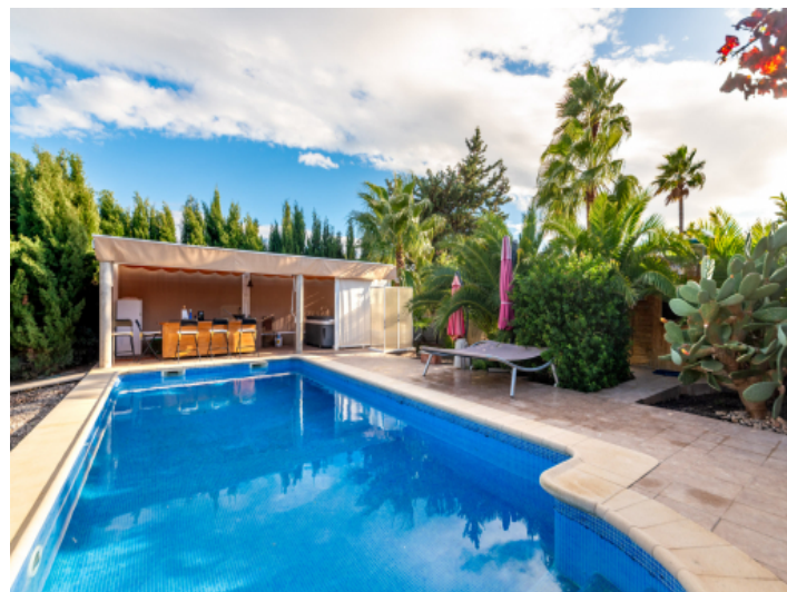
Views from the pool to the summer kitchen