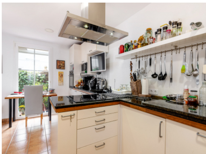
Fully equipped kitchen and dining area