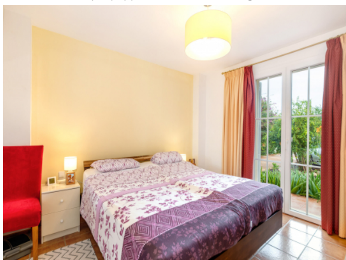
Bedroom with floor to ceiling windows