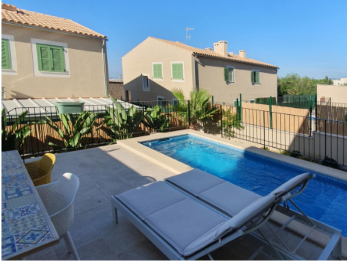
Beautiful semi-detached house in Sa Cabaneta with 4 large