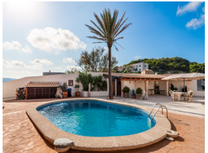
Pool is surrounded by a terrace