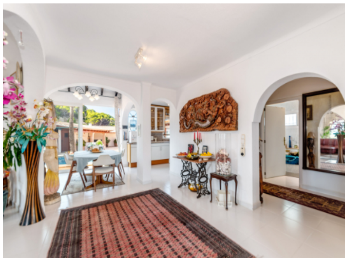
Open dining area