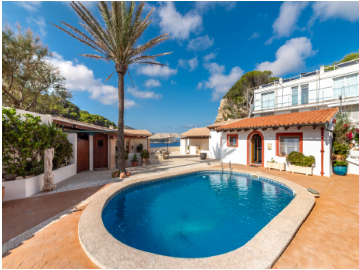
Mediterranean pool area