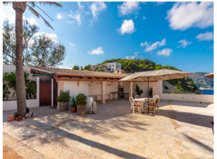
Terrace with mediterranean sea views