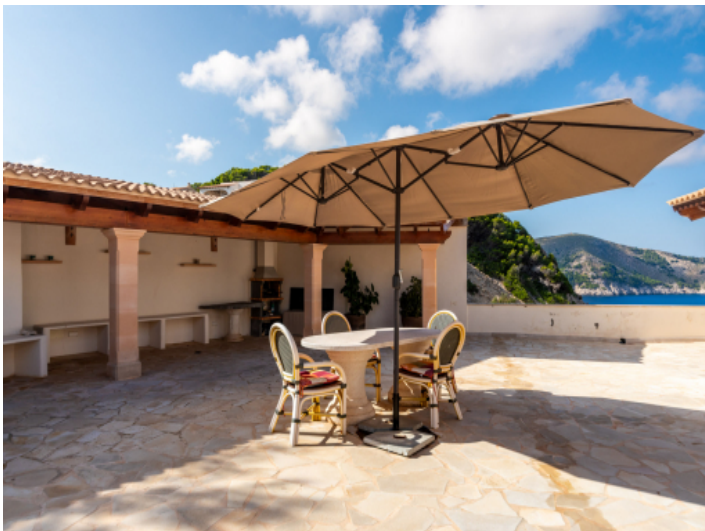
Terrace with outdoor kitchen