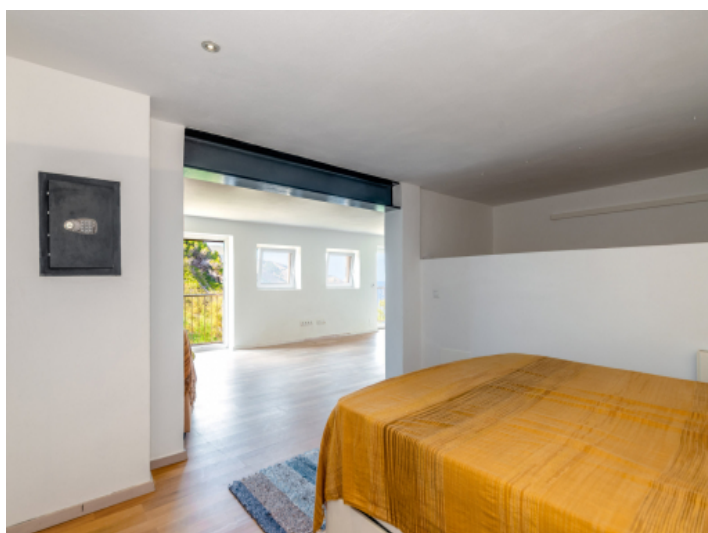
Upper apartment with bedroom