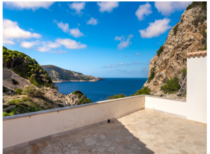
Sea views from the terrace