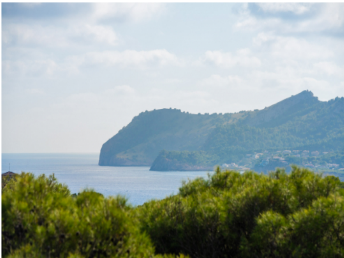
Unique landscape views