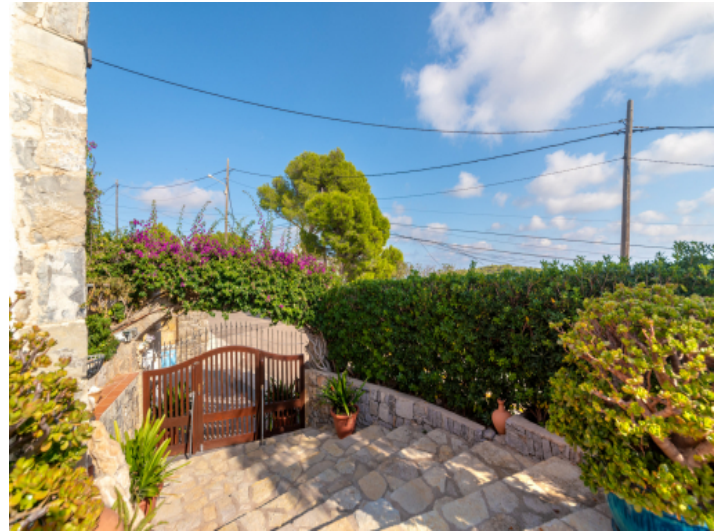
Entrance to the villa