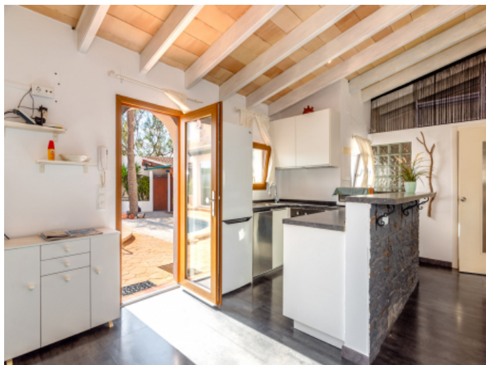
2nd kitchen with bar