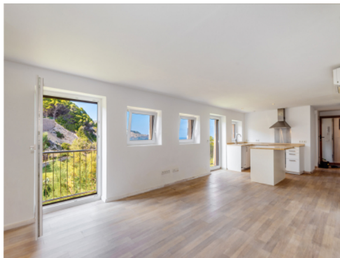
Upper apartment with kitchen