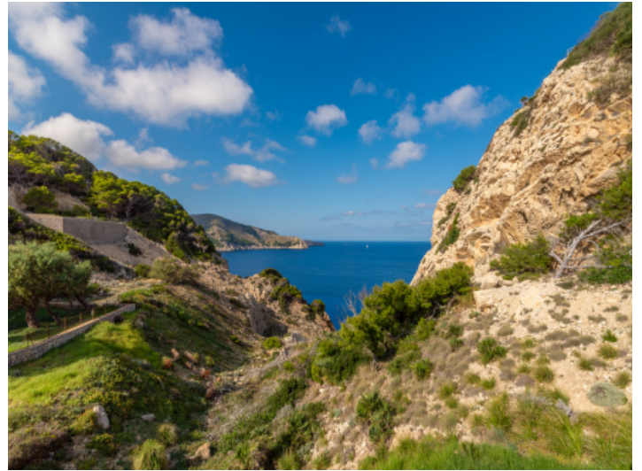
Impressive sea views