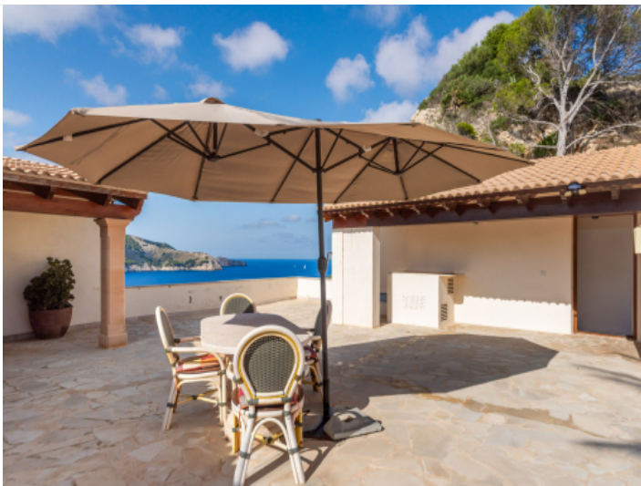
Terrace with sea views