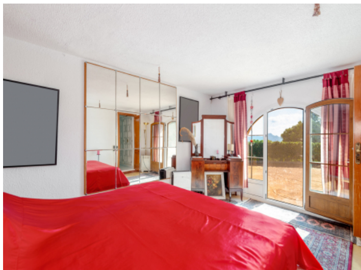
Bedroom with terrace access