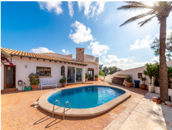
Well-tendet pool area