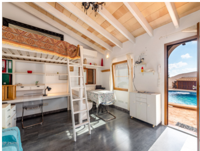
Studio with pool access