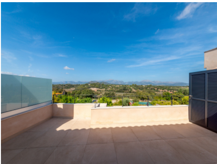
Brilliant views over the landscape