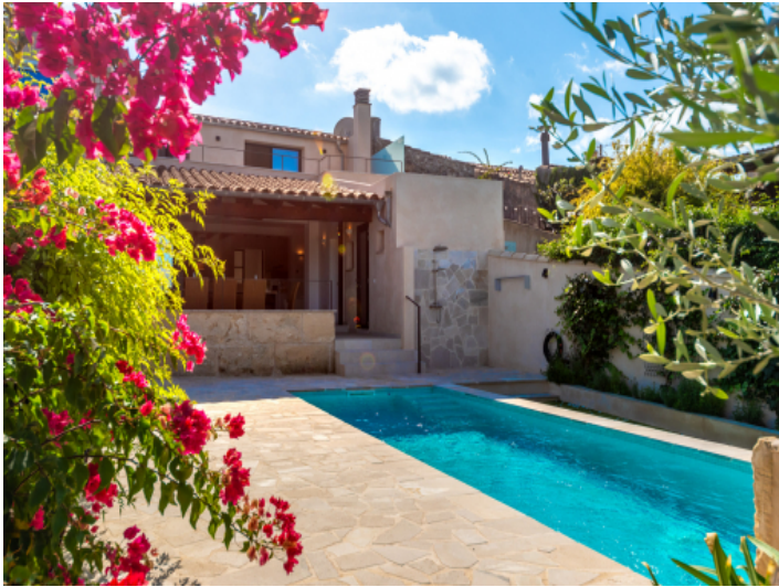
Modern townhouse with pool in Llubi