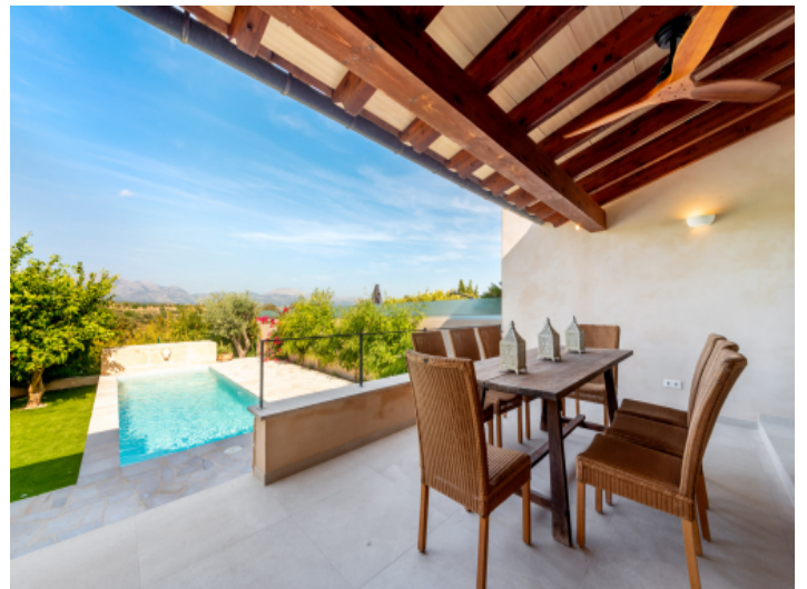
Balcony from the townhouse