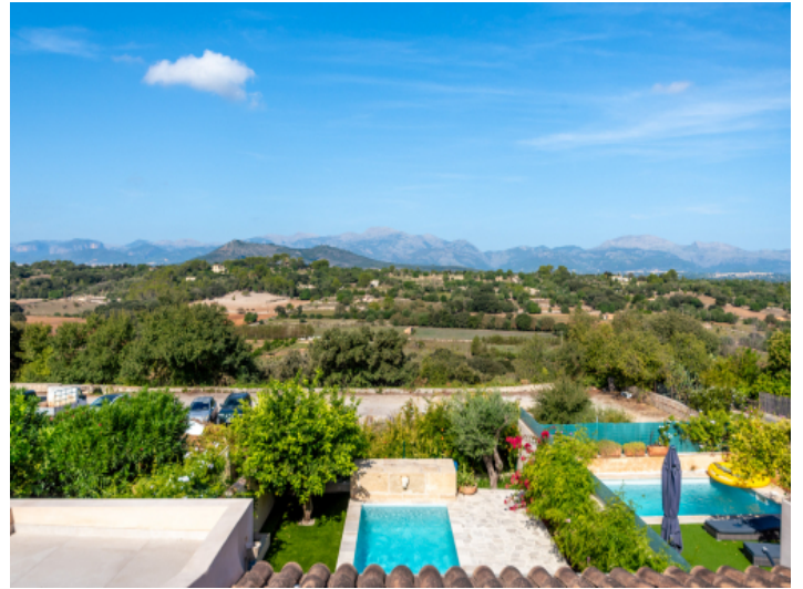
Unique landscape views