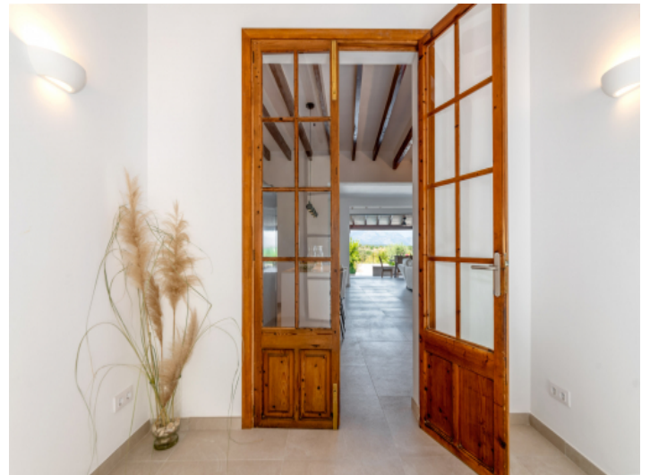
Entrance from the townhouse