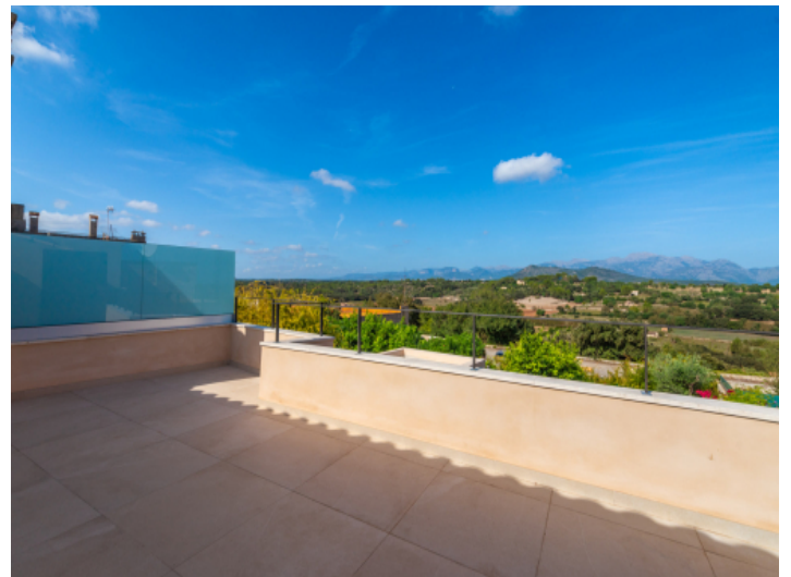
Fantastic roof terrace