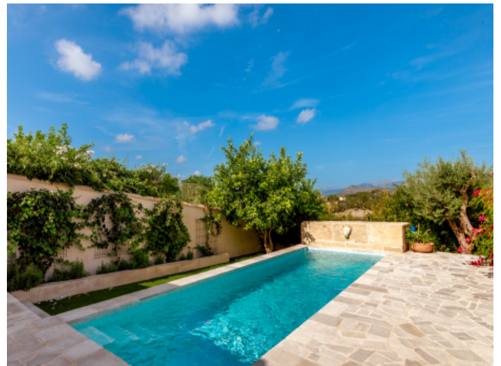
Idyllic pool area