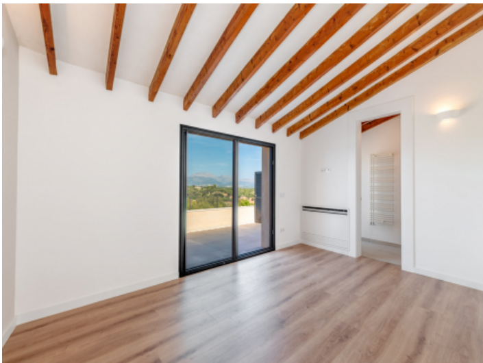
Bedroom with balcony access