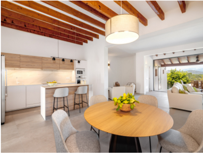
Open dining area