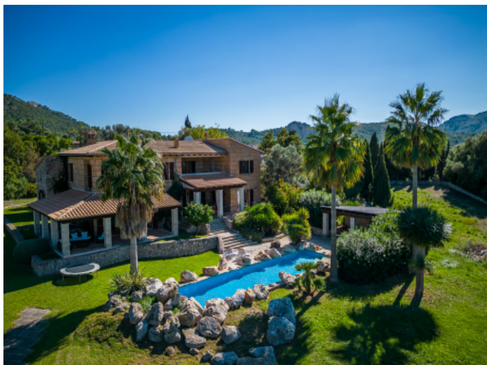
Views to the finca