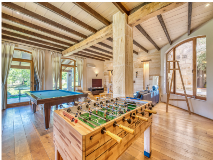
Living area with billiard table and table kicker