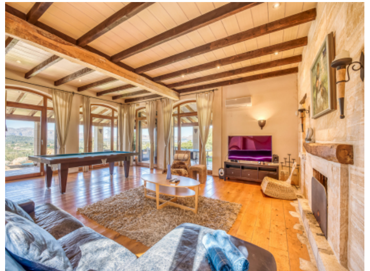
Living area with floor to ceiling windows