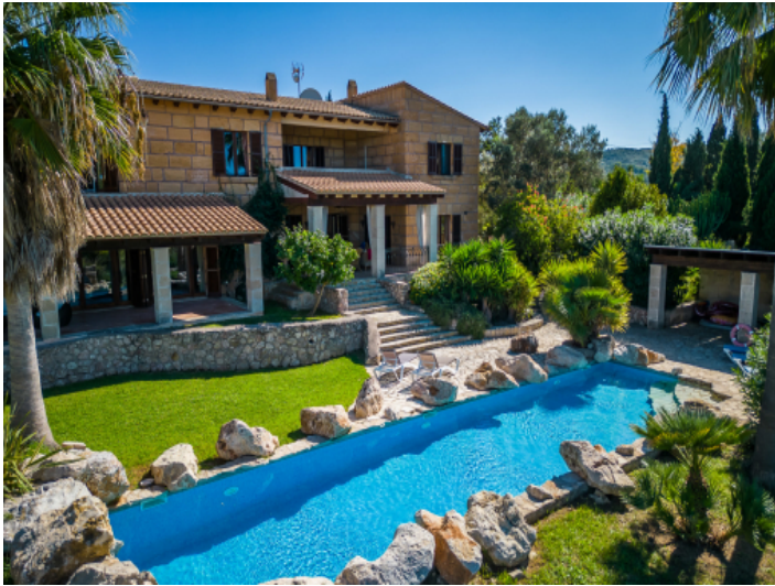
Mediterran garden with pool