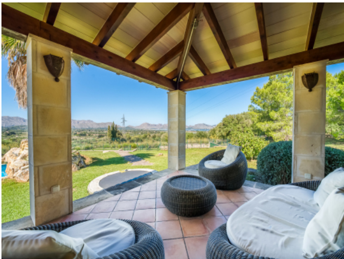
Covered terrace with lounge area