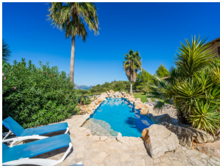
Mediterran pool area