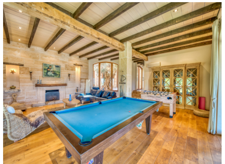
Impressive living area