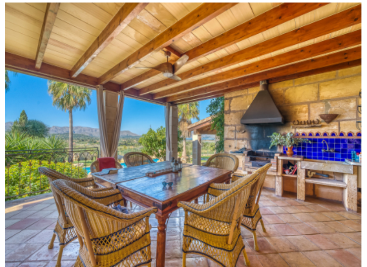
Covered terrace with outdoor kitchen