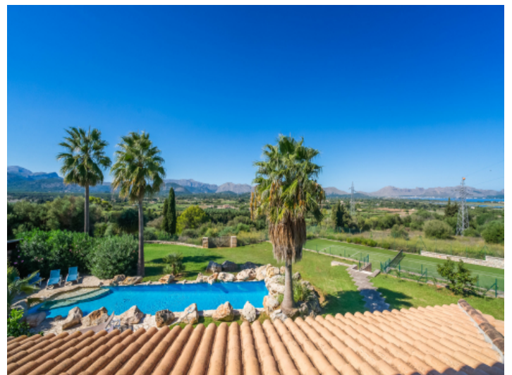
Unique landscape views from the balcony