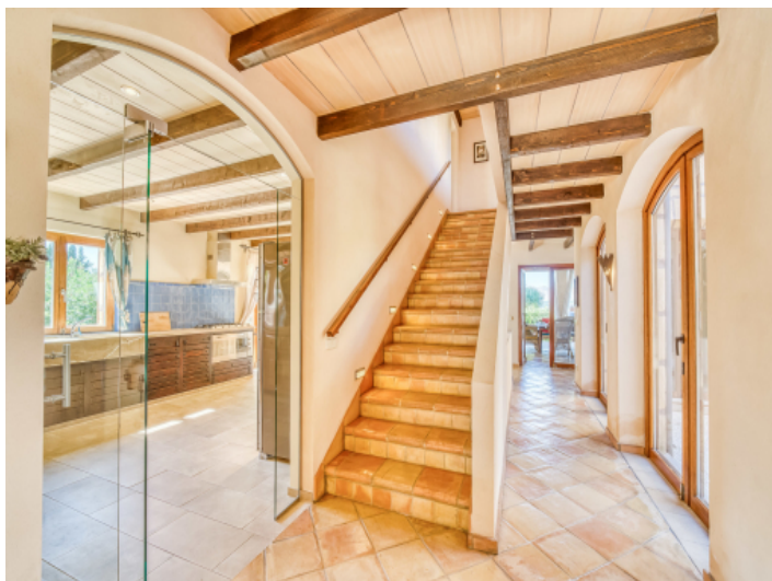
Floor from the finca