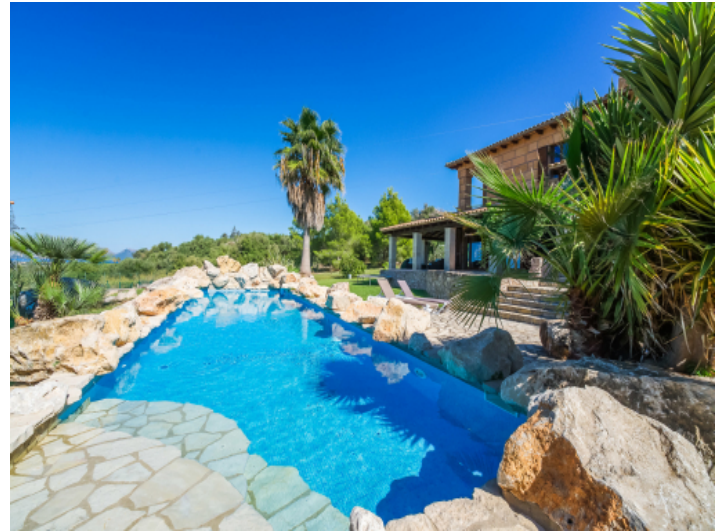
Mediterran finca with pool and tennis court in Alcudia