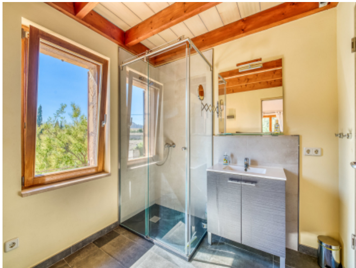
Bathroom with daylight