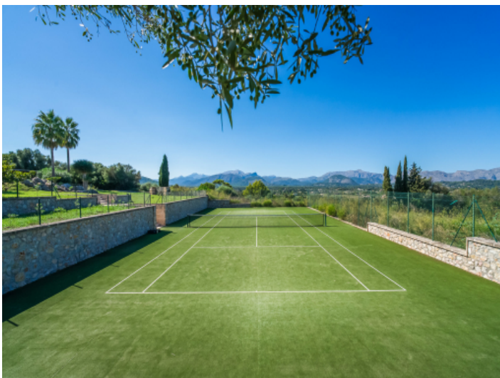
Fantastic tennis court