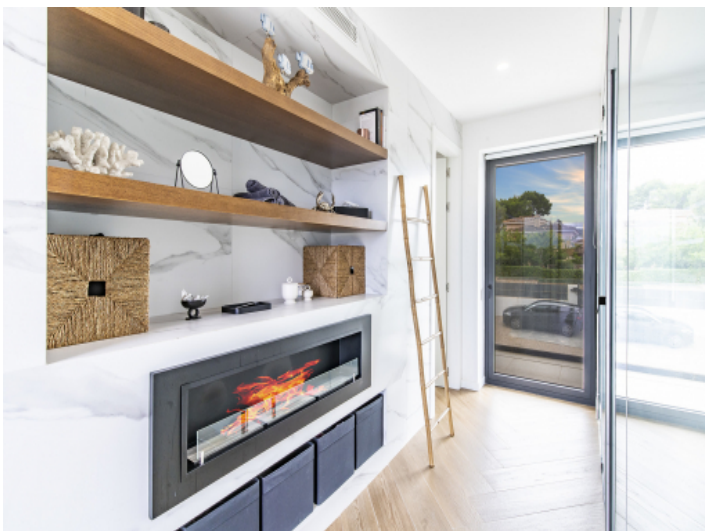
High quality interior