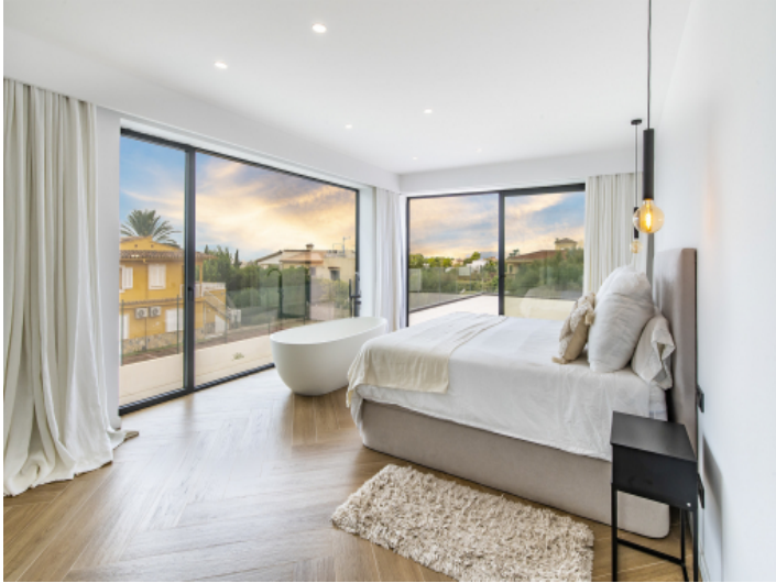
Double bedroom with a lovely view