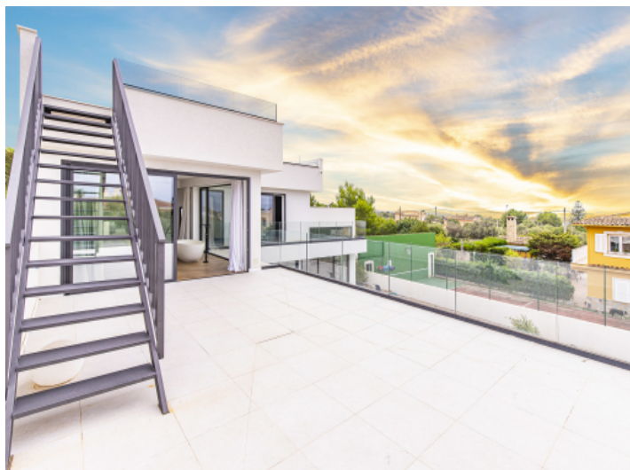
Various, large terraces on the roof