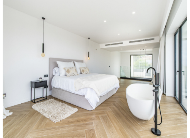
Alternative bedroom view