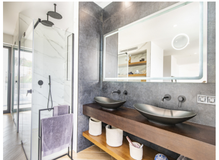
Stylish bathroom with shower