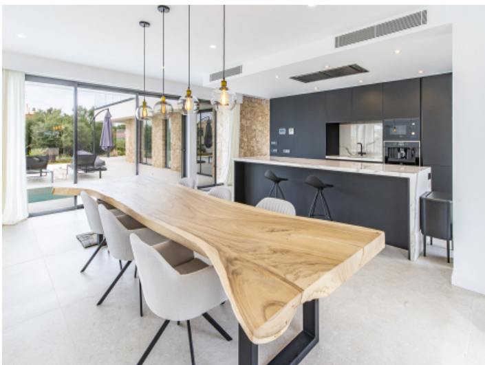
Dining area and American kitchen