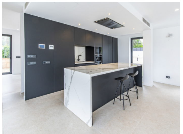
Fully equipped, contemporary kitchen