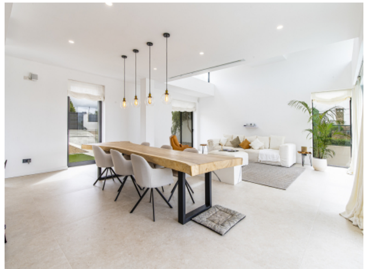
Bright, spacious dining area