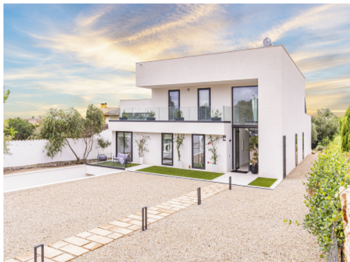
Exterior view and entrance