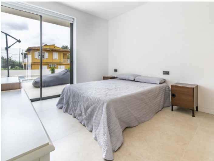
Double bedroom with access to a terrace