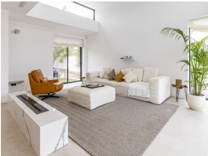
Minimalistic living area