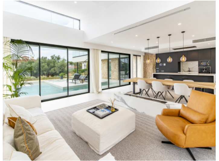
Living and dining area with direct access to the terrace