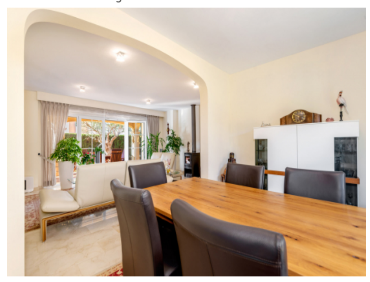
Large dining area