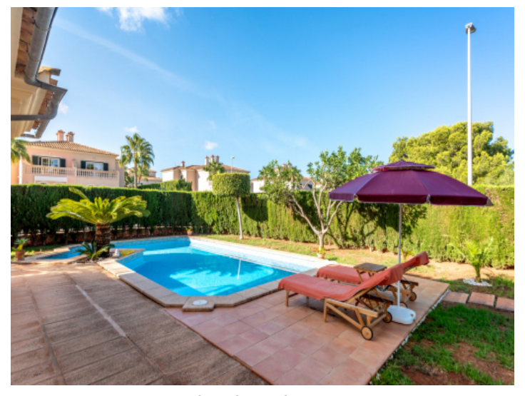
Lovely pool area