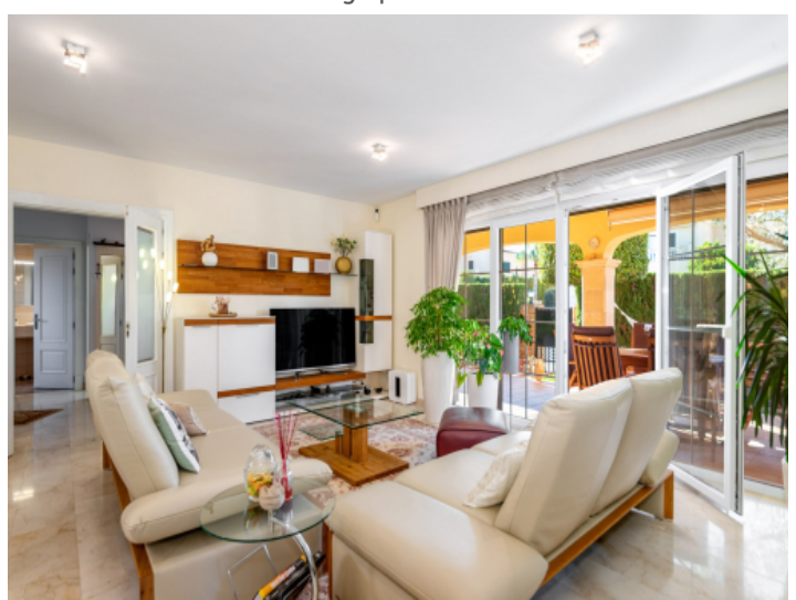
Living area with access to a terrace