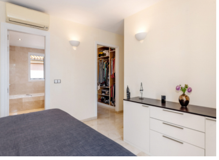
Master bedroom with dressing room