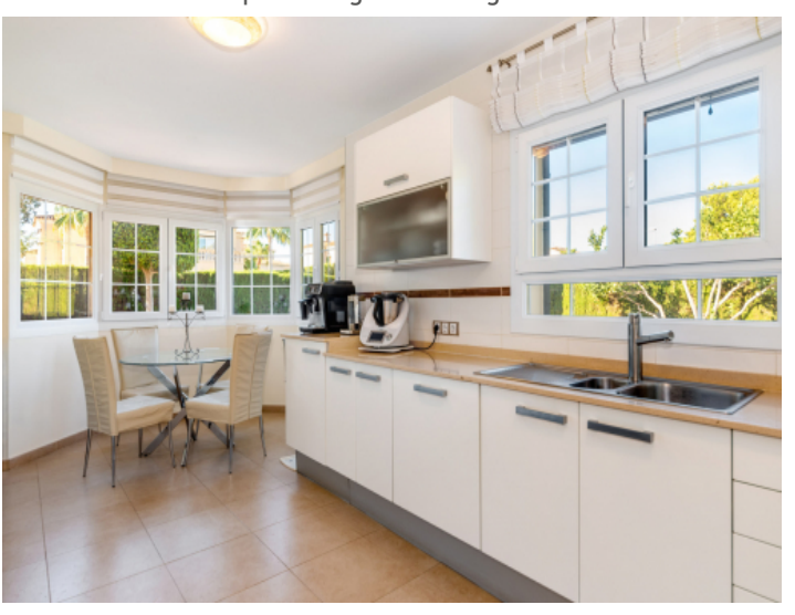
Modern, live-in kitchen