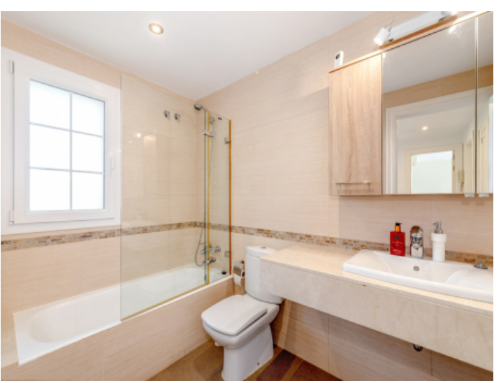
Guest room Bathroom