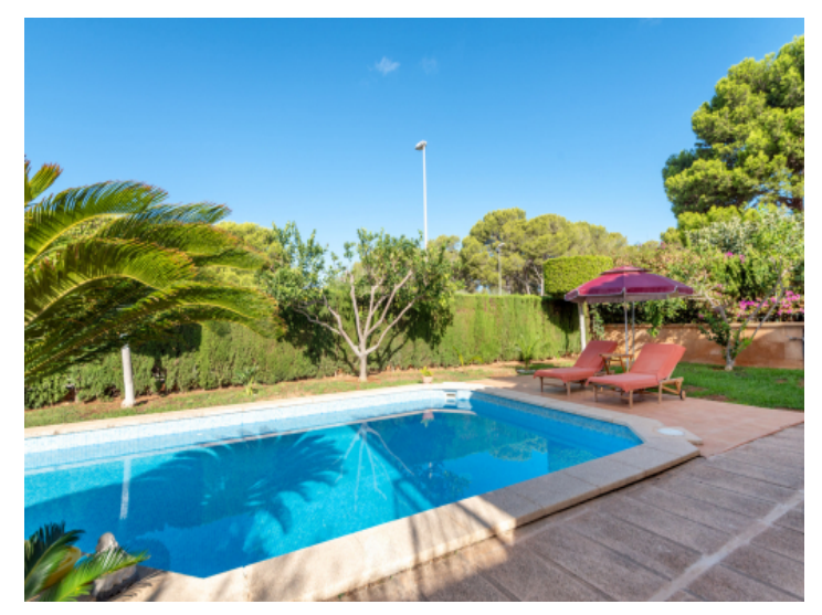
Large pool area