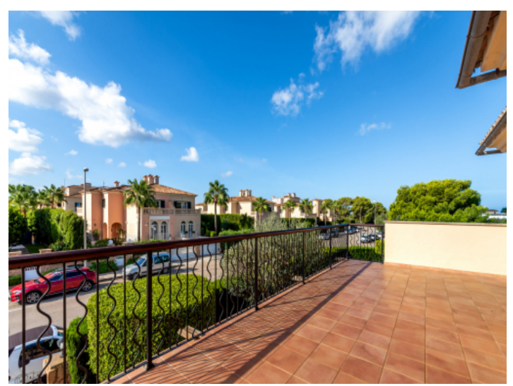
Ample sunny terrace