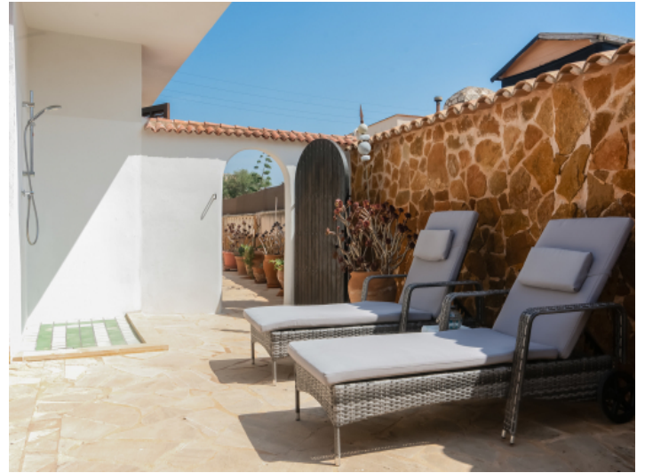
Sunny terrace with exterior shower