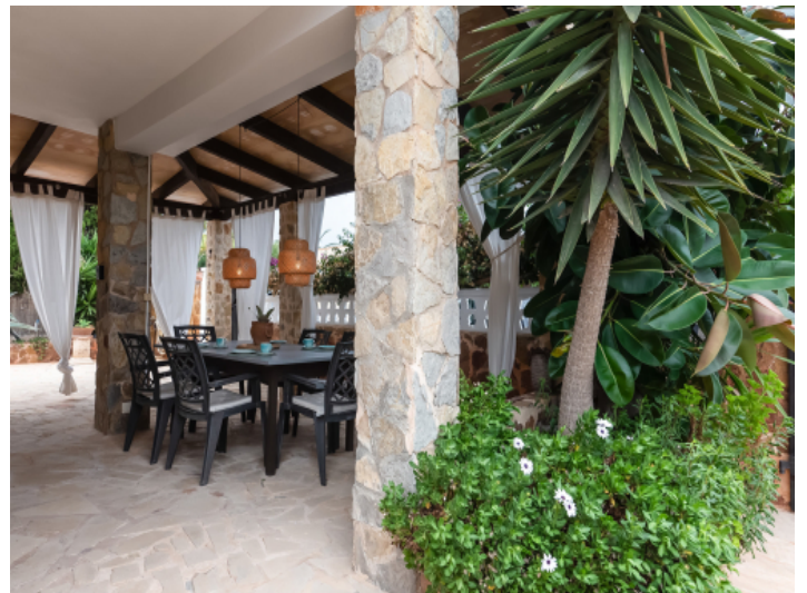
Covered terrace with dining table