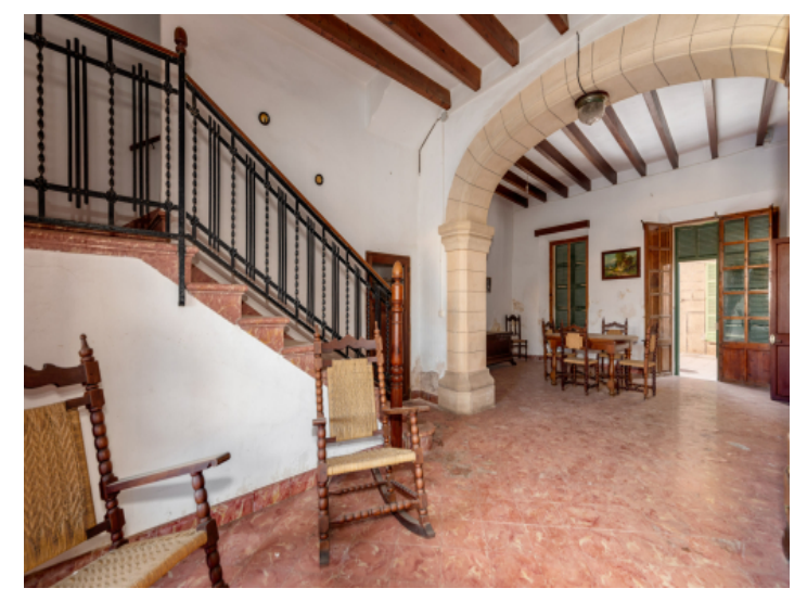
Mallorcan hall witth access to the upper floor