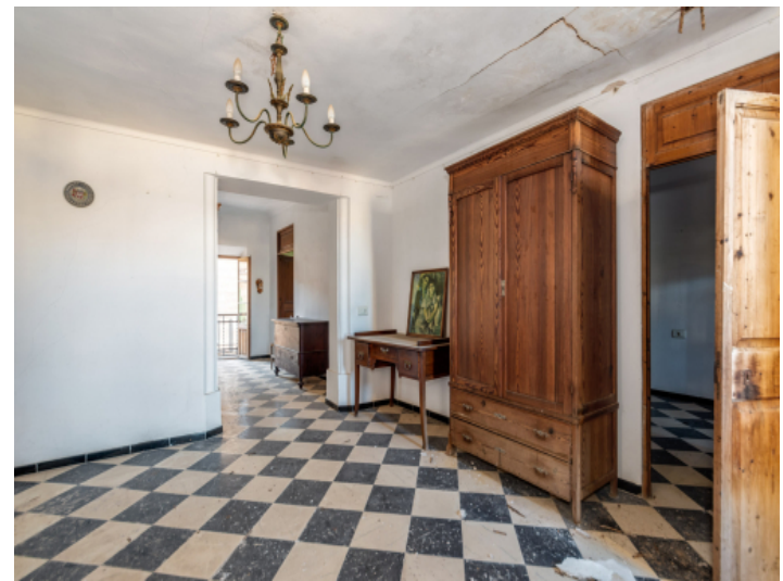
Bedroom on the upper floor