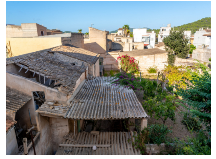
View over the garden