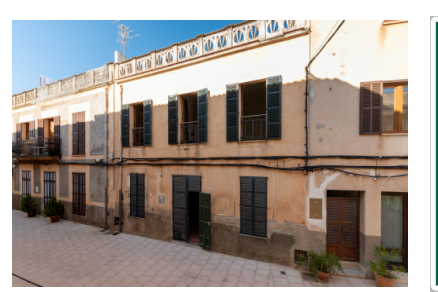
Son Servera search for property MAL-120716