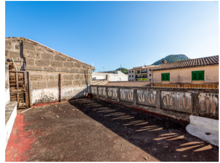
Large roof terrace