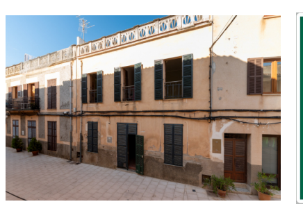
Son Servera search for property MAL-120716