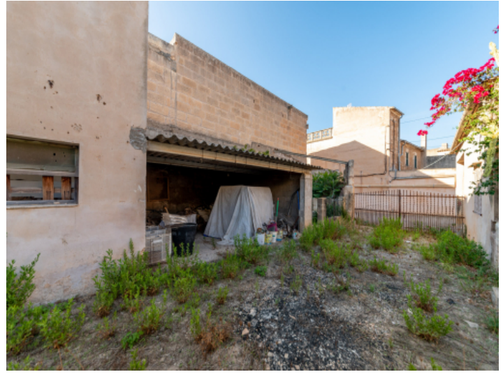
Garden with access from the street

PORTA MALLORQUINA • C./ COLOM 20 2°, 07001 PALMA, SPAIN TEL.: +34 971 698 242 • INFO@PORTAMALLORQUINA.COM • WWW.PORTAMALLORQUINA.COM