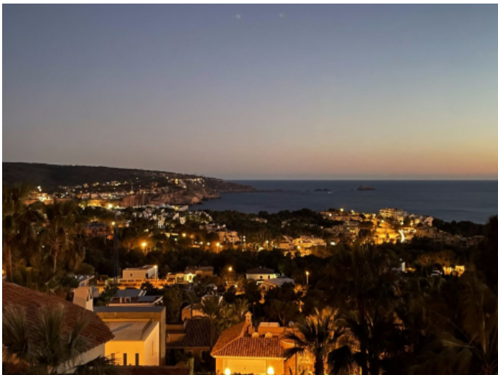
Views during the night over Santa Ponsa and the sea