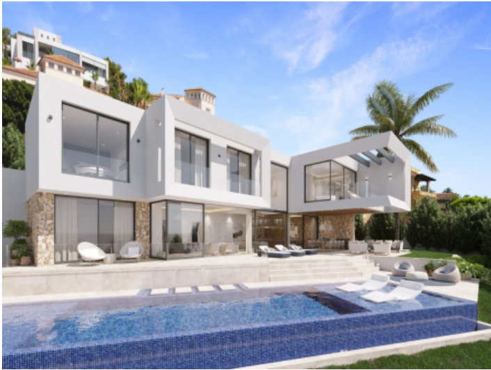
Spectacular pool area