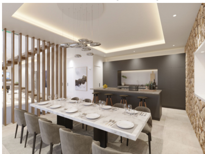
Open kitchen and dining area