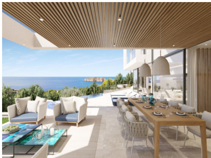
Covered terrace with lounge and dining area