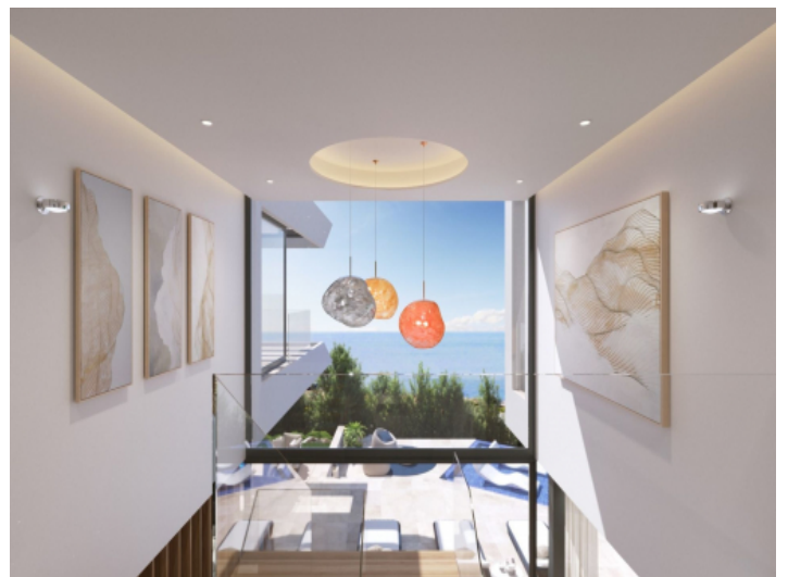
Gallery with sea views