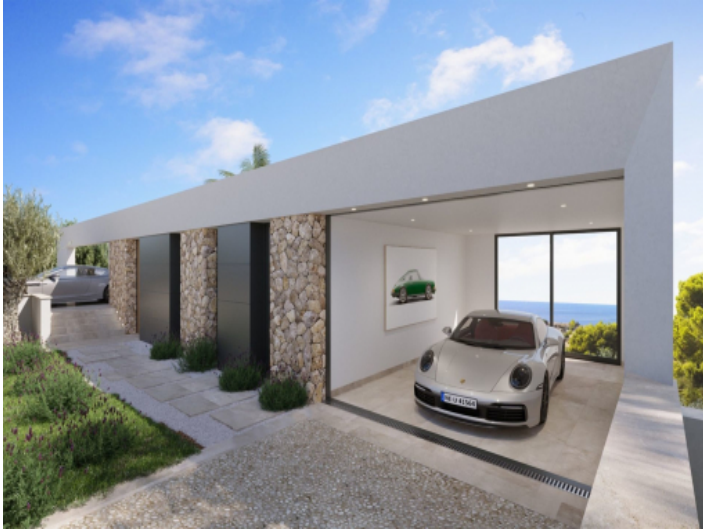
Garage with mediterranean sea views