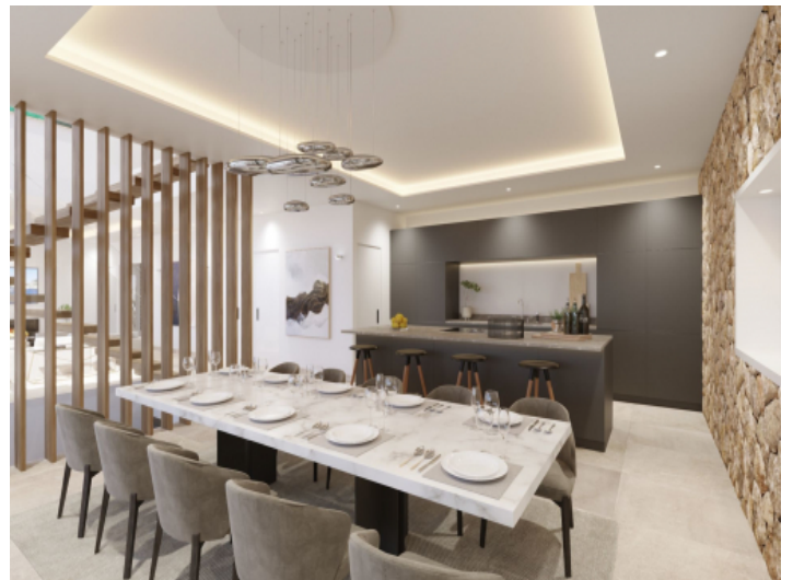
Open kitchen and dining area