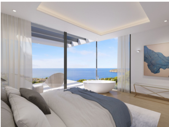
Bedroom with balcony access and bathtub