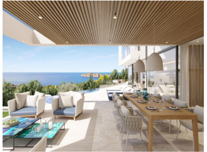
Covered terrace with lounge and dining area