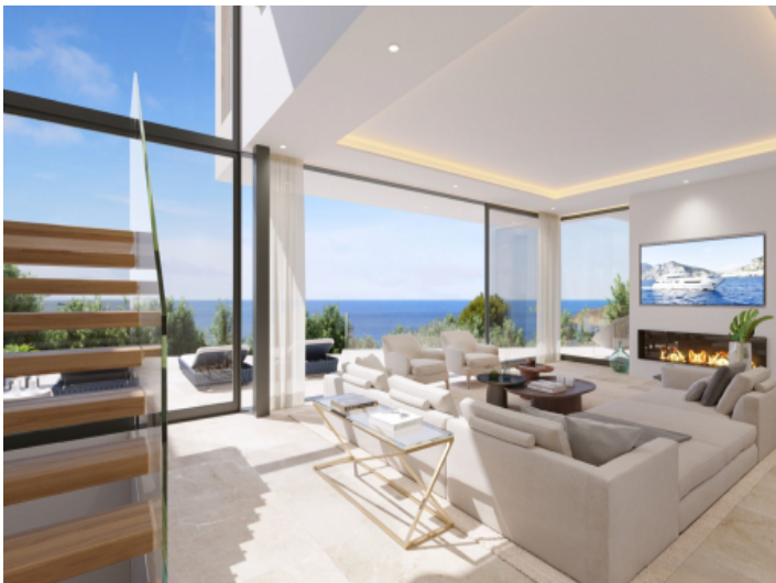
Light flooded living area