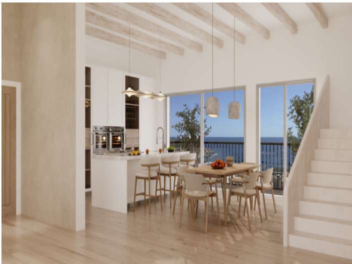
Kitchen with sea views