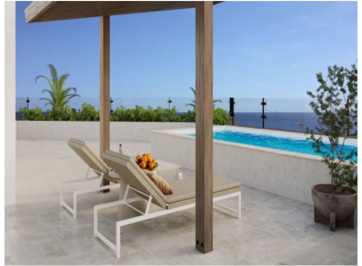
Fantastic roof terrace with pool