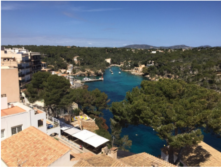
Location of the house