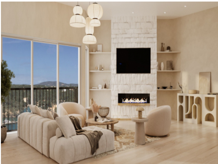
Open living area with fireplace