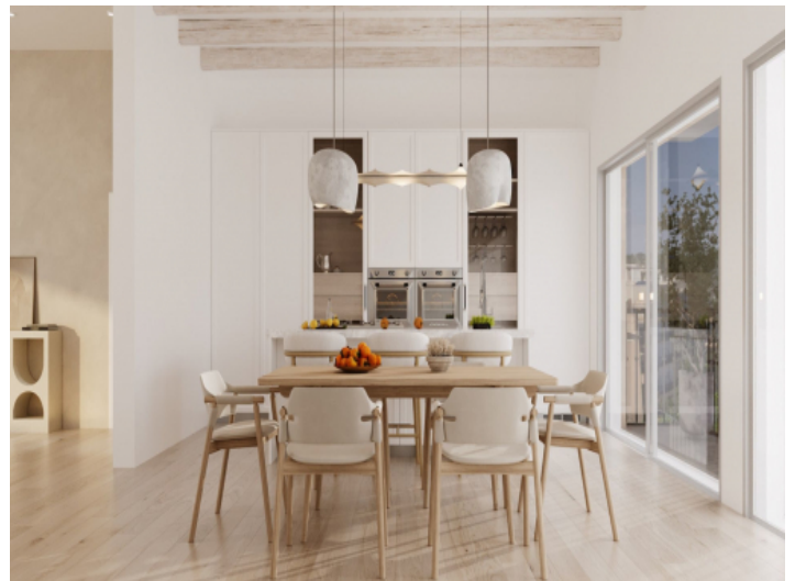
Beautiful dining area