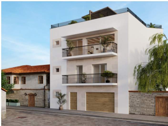
Exterior view of the house