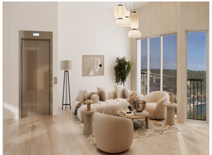
Elegant interior design