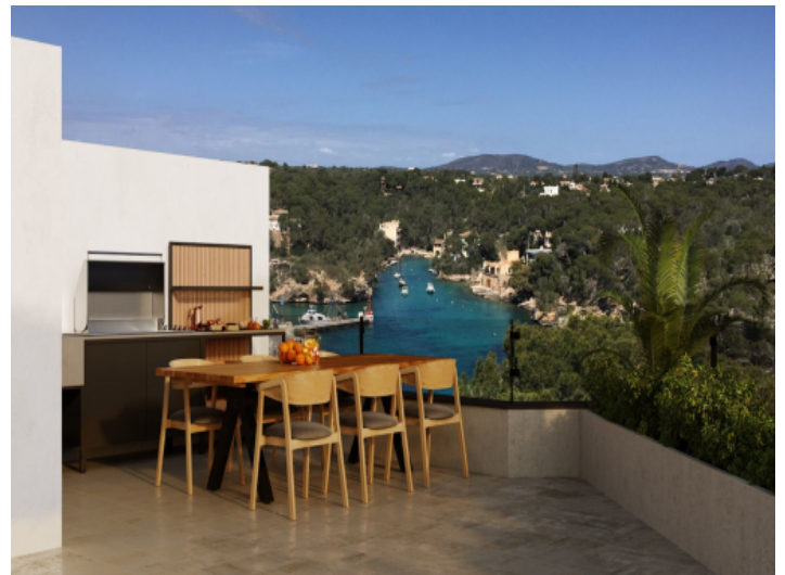
Bbq sea view terrace