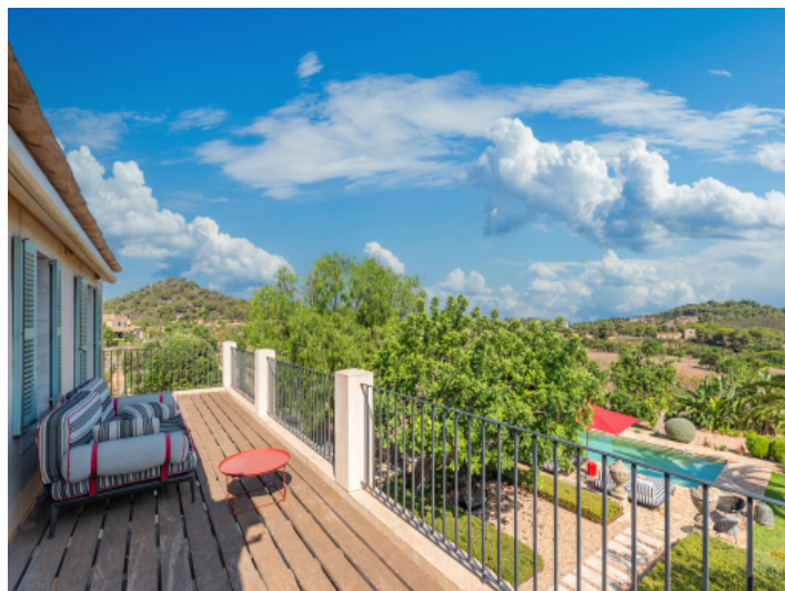
Balcony with pool views