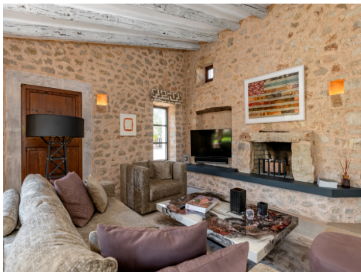
Cosy living area