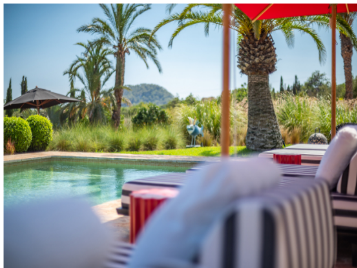
Idyllic pool area