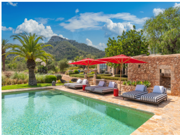
Sunny pool area