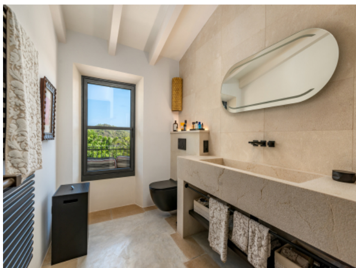
Bathroom with garden views