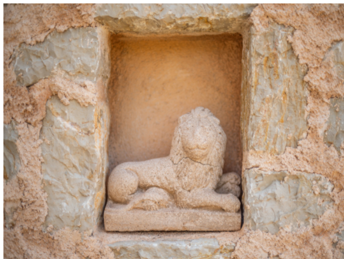
Wall with details