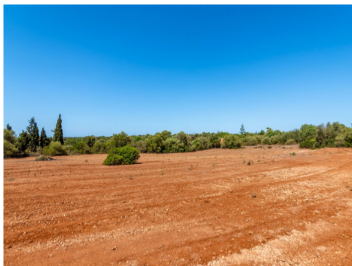
Plot of land