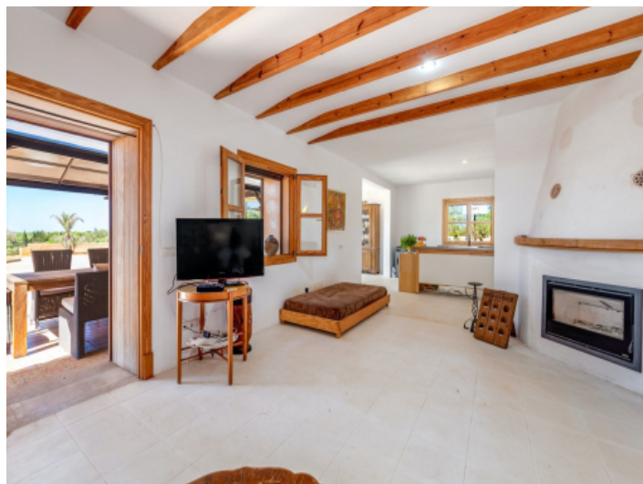
Spacious living area with fireplace