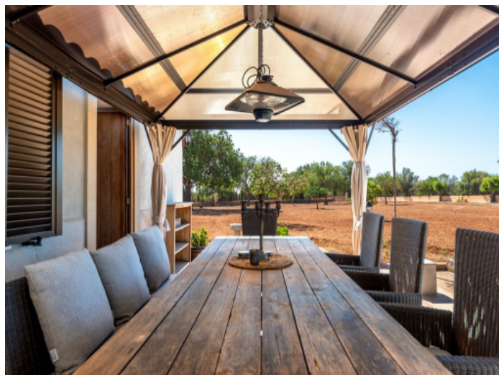
Additional outdoor dining area