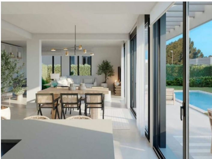
Living and dining area with terrace access