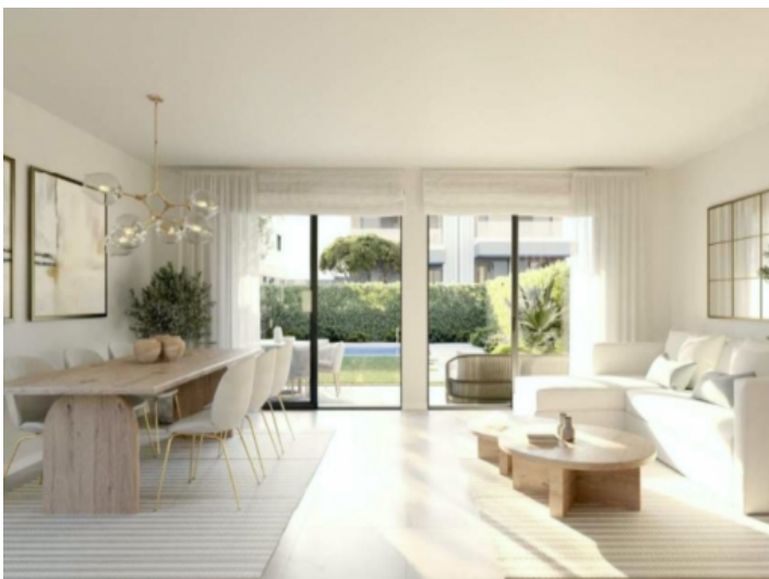
Spacious living and dining area