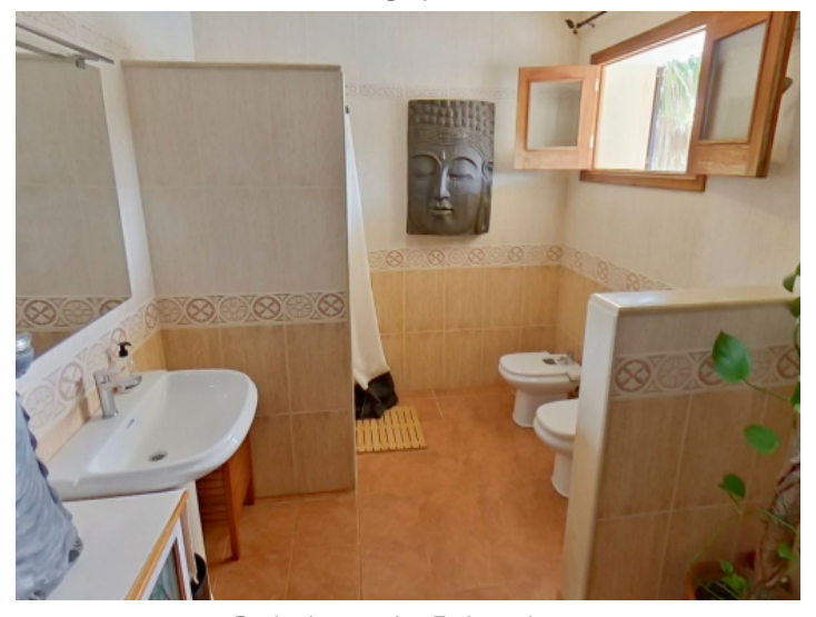
Badezimmer im Erdgeschoss