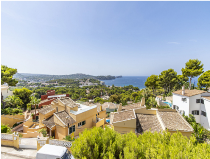
Unique mediterranean sea views