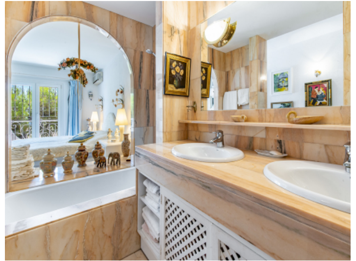
Bright bathroom with bathtub