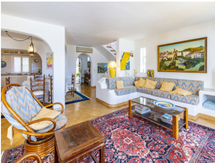
Living area with views to the floor