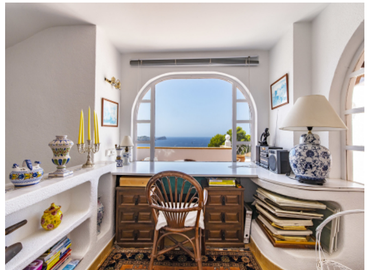
Office with sea views