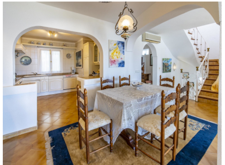
Views from the dining area to the kitchen