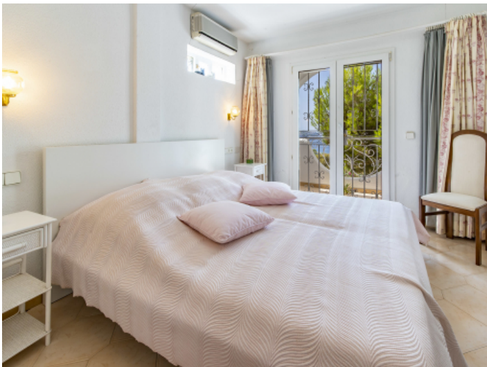
Bedroom with floor to ceiling windows