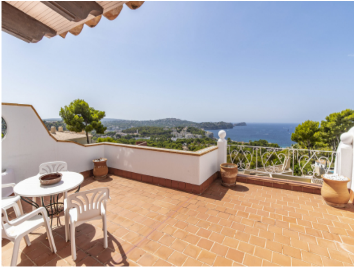
Terrace with sea views