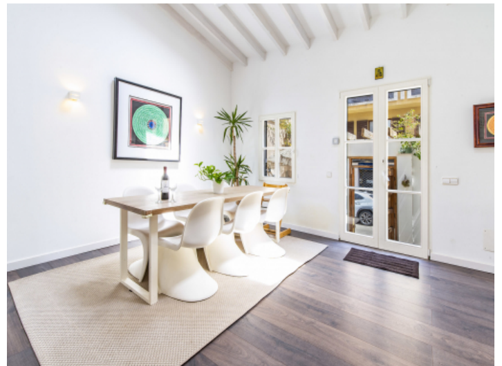
Light flooded dining area