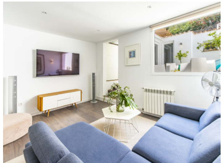
Cosy living area with access to a patio