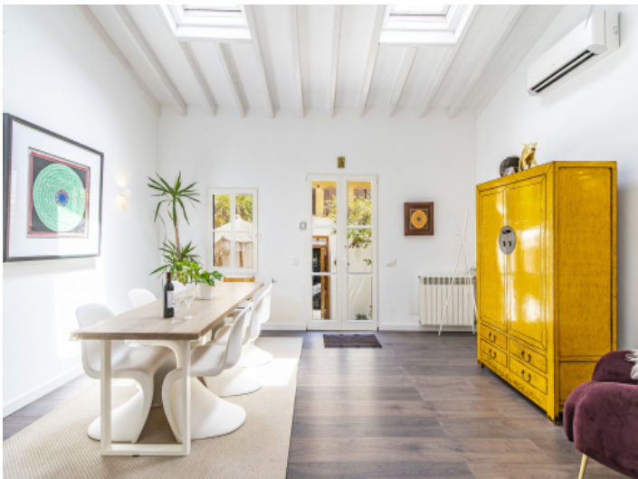
Beautiful dining area with access from the outside