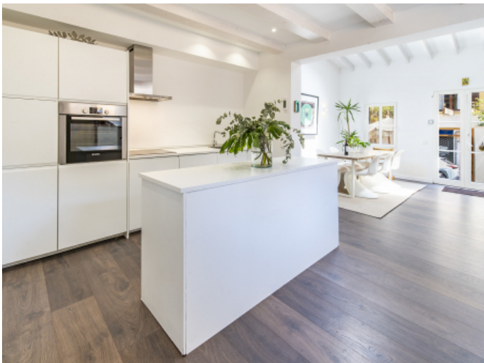
Modern, open kitchen