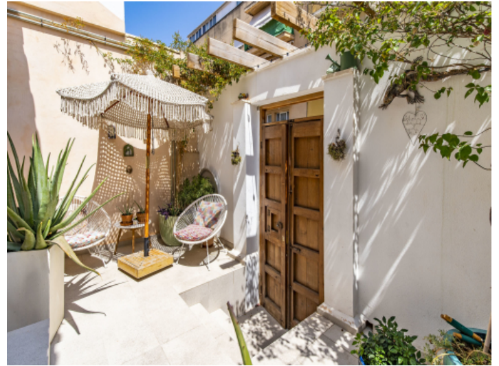
Mediterranean terrace and entrance door