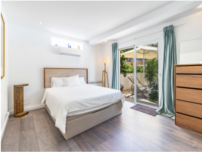
Bedroom with balcony access