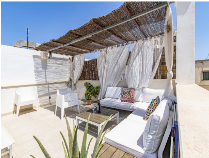
Cosy lounge area on the covered terrace