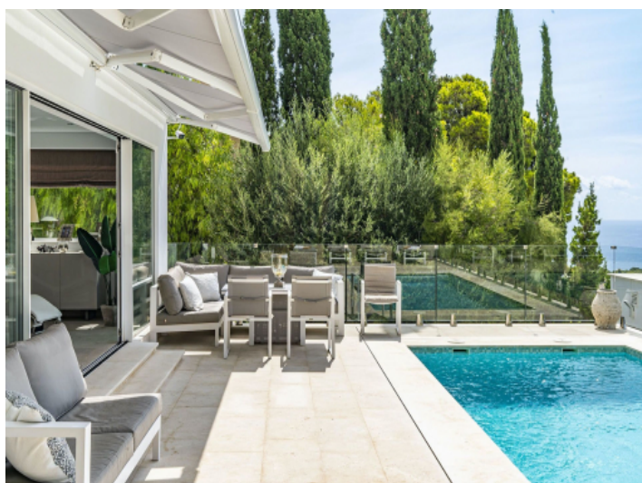
Lovely pool area