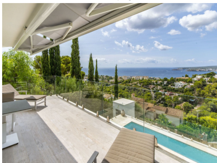
Sunny terrace with awning