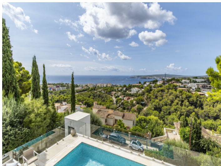
Fantastic sweeping views