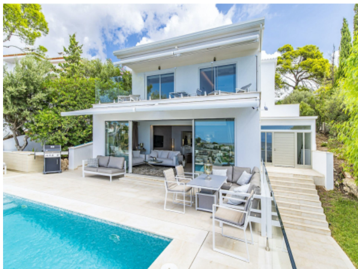
Modern luxurious villa