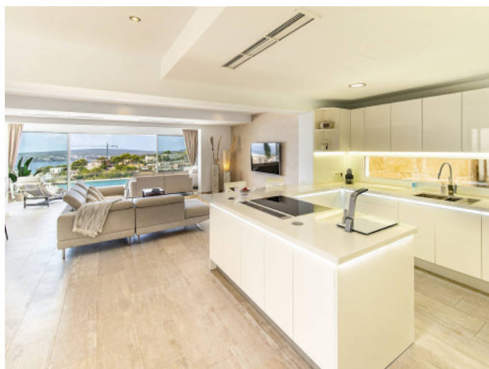
Open living and dining area with the kitchen