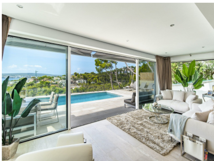
Living area with direct access to a terrace