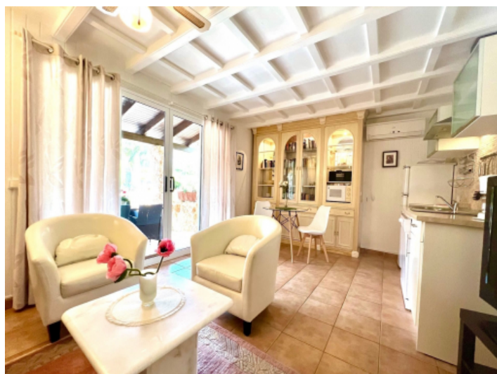
One of 6 apartments