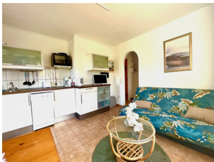
One of 6 apartments