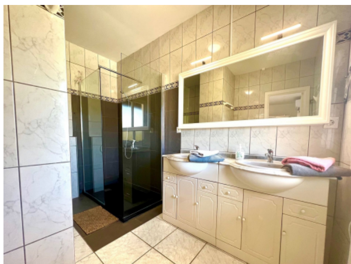
One of 7 bathrooms