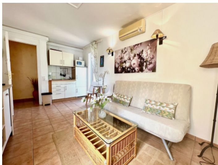
One of 6 apartments