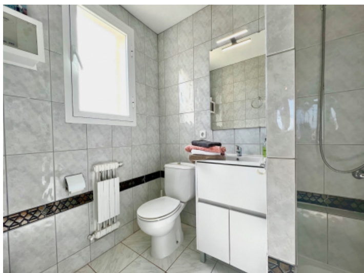
One of 7 bathrooms