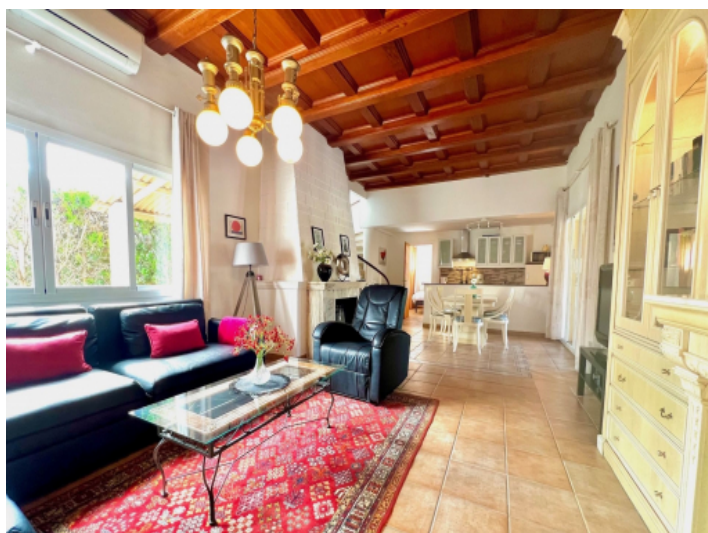
One of 6 apartments