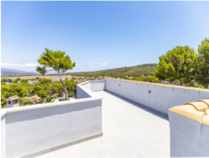
Sunny roof terrace