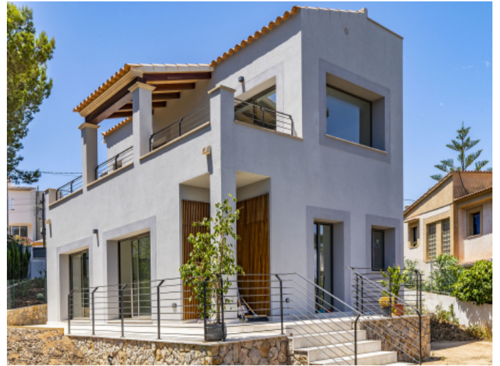
Front view from the villa