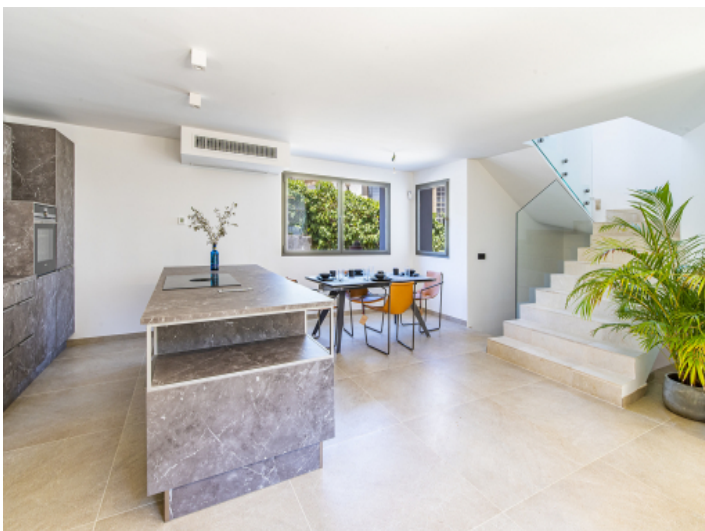
Views from the kitchen to the dining area