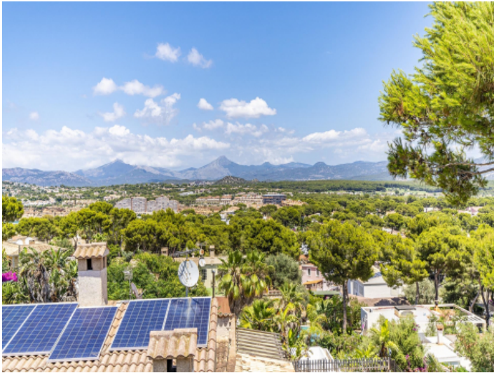
Views over the lanscape