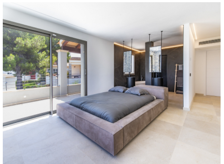
Bedroom with direct terrace access