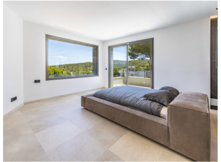
An other bedroom