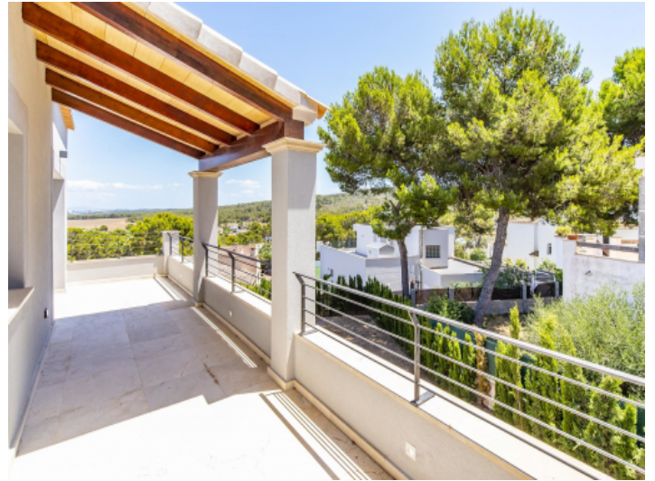
Exciting views over the landscape