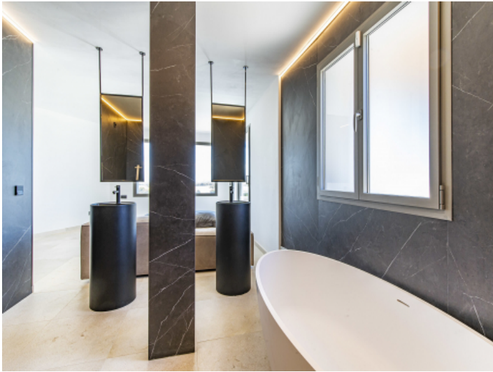
Bathroom en suite from the master bedroom