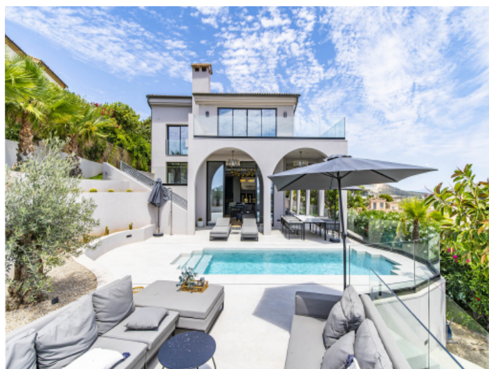
Terrace with lounge area