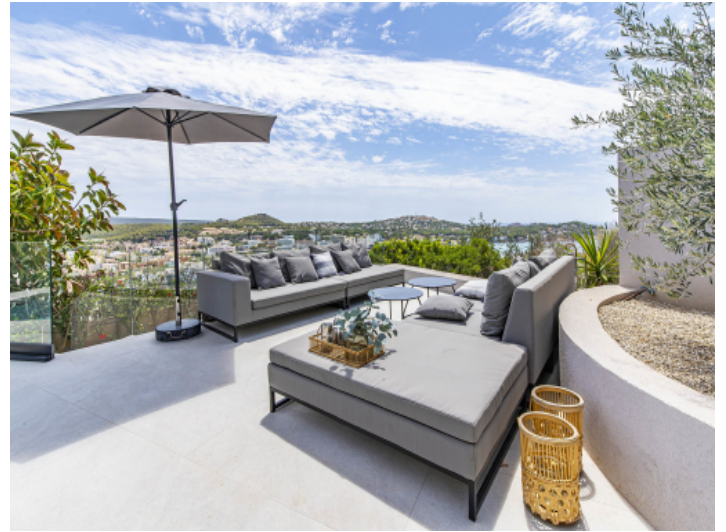
Lounge area on the terrace