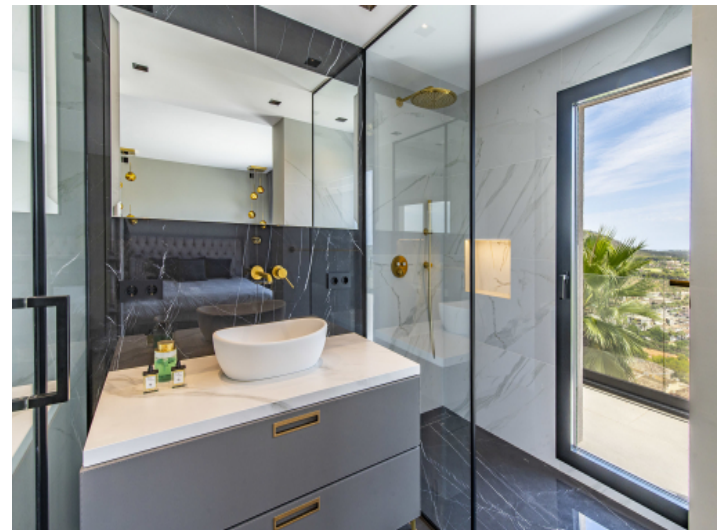
Bright bathroom with walk-in shower