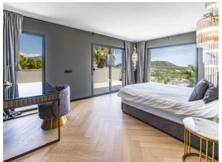
Bedroom with direct balcony access