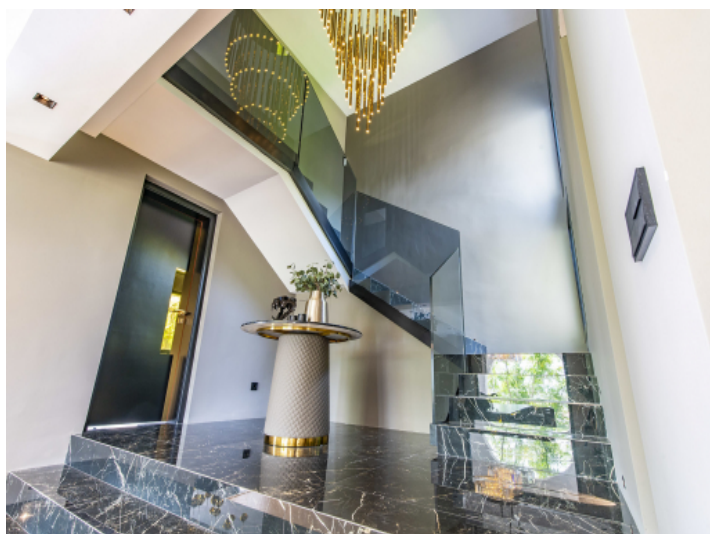
Entrance hall from the villa