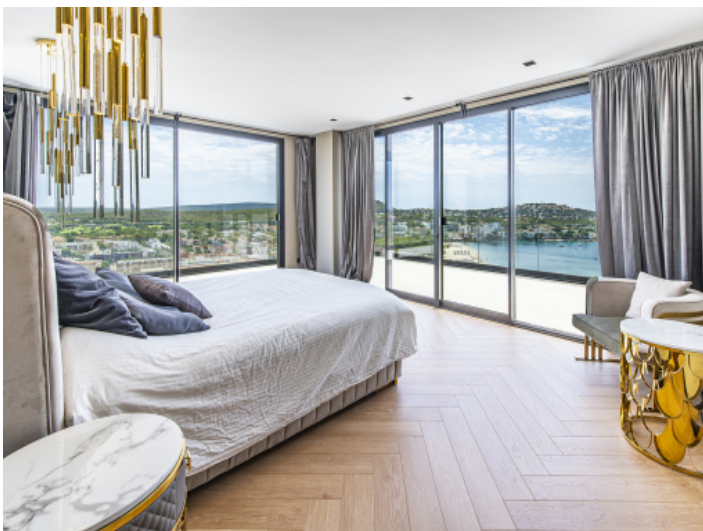
Bedroom with floor-to-ceiling windows