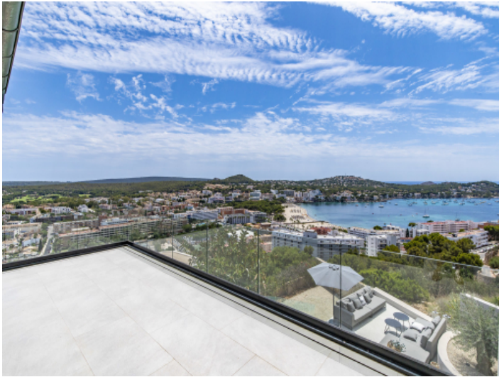
Balcony with sea views